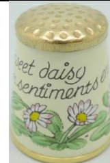
"Sweet daisy ... sentiments" with a verse