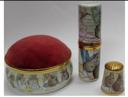
Tailor of Gloucester © F.W & Co 1985 lettered inside with matching needlecase and pincushion unbranded

Frederick Warne was the publisher of Beatrix Potter's children's books