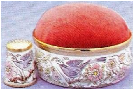
blue bird Chinoiserie corresponds to drawing #96

R: incomplete from the workshop in Poole lower: thimble and matching pincushion initials PS