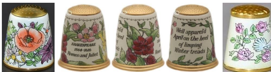
L: Staffordshire Enamels - C: Halcyon Days - R: Crummles

Examples of other enamelled thimbles have either a Staffordshire Enamels or a Halcyon Days maker's mark.