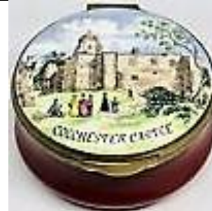
Colchester Castle pill box