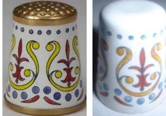
heraldic harp yellow and red

R: no brass trims - and only first outlines in black and white