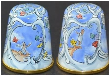
garlanded female figures or fairies pale blue ground no brass apex showing Crummles box with royal cipher