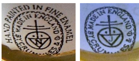
Crummles & Co backstamps backstamp at left is the older of the two

In 2022 black and white outlined designs - with no colour have appeared for sale of ebay