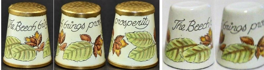
"The Beech brings Prosperity" with a verse

R: incomplete from the workshop in Poole