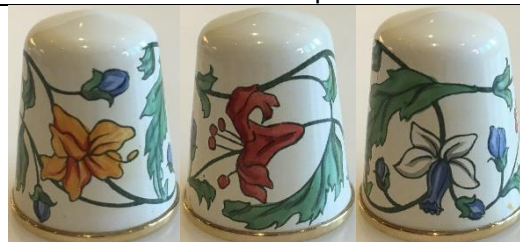
lilies & daffodils no brass apex