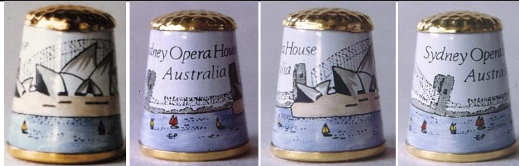
Sydney Opera House Australia