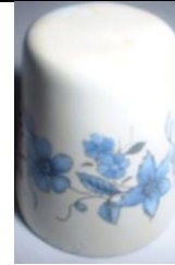
blue floral band incomplete version missing brass rim

R: incomplete version missing its brass rim