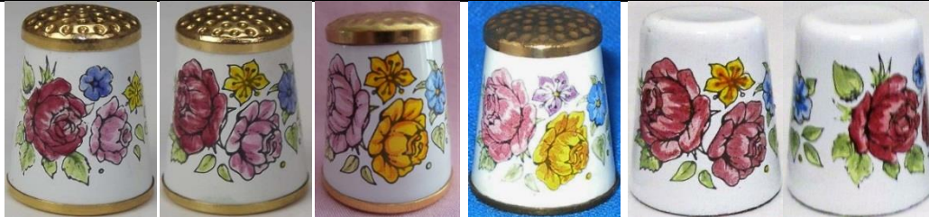
pink and yellow roses corresponds to drawing #90 two C: colourways R: incomplete from the workshop in Poole