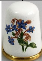
blue flowers no brass apex unmarked