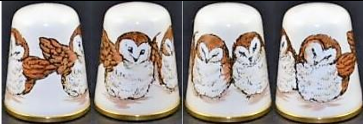
owls no brass apex