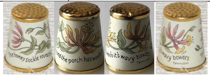
"The honey suckle round the porch has wov'n it's wavy bowers" Tennyson