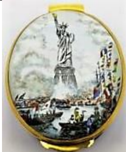
Statue of Liberty 1886-1996 commemorative pill box