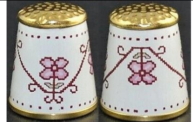
embroidery stitches in mauve