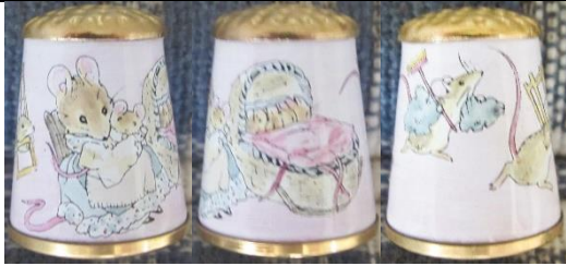
Three Bad Mice © F.W & Co (Frederick Warne) lettered inside unbranded Warne was the publisher of Beatrix Potter's children's books

Frederick Warne was the publisher of Beatrix Potter's children's books