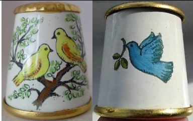
doves - yellow in a tree this decal also used by Halcyon Days