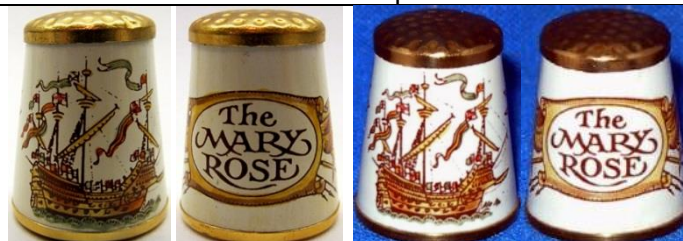
The Mary Rose R: unbranded with copper trims