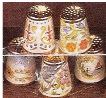
display of Crummles thimbles from John Sinclair (shop) England 1980s