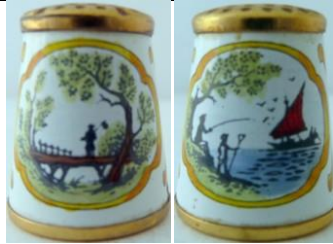
fishing scene corresponds to drawing #88 man on bridge – fisherfolk with yacht

this ad appeared in the 1st issue 1981 of The Thimble Society of London the accompanying nine line-drawings has been useful in finding and identifying Crummles thimbles I have used the same terminology and numbering, until something else comes to light