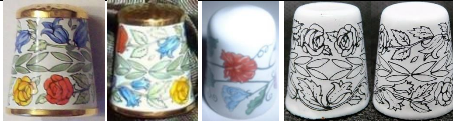
roses and harebells corresponds to drawing #89 C: incomplete version missing brass trims R: no brass trims – with only first outlines in black and white