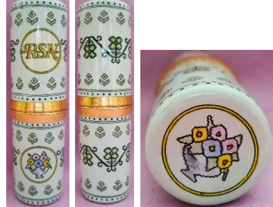
Royal School of Needlework showing 'RSN' logo on side of needlecase school is housed in Hampton Court Palace England is there a matching thimble?