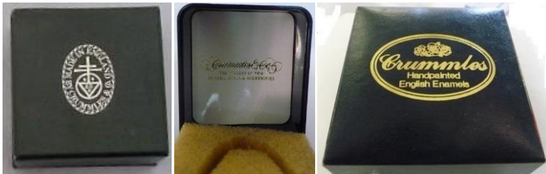
Crummles & Co thimble boxes