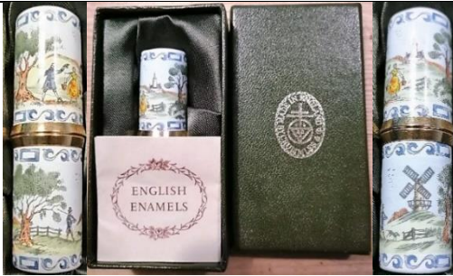
rural Dutch scenes boxed needlecase - pincushion is there a matching thimble?