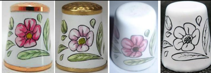
pink flower - called yellow pansy?