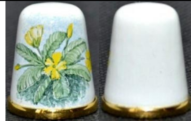
primroses no brass apex