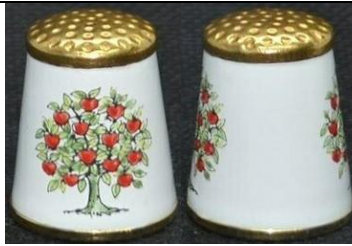
apple tree on two sides