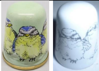
blue birds no brass apex

R: incomplete from the workshop in Poole