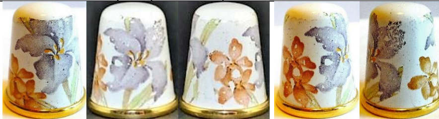
iris no brass apex