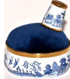
willow pattern with matching pincushion