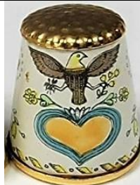
eagle and heart this decal also used by Halcyon Days