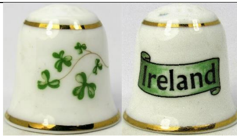
trellis shamrock flared rim 'Ireland' banner on verso