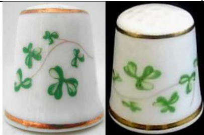
trellis shamrock Thimbles of the world's porcelain houses (Franklin Mint 25 set) traditional shape