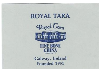
Thimble Collectors Club's The Hallmarked Thimbles of the World's Great Porcelain Houses certificate for the Royal Tara thimble.

A second set was issued by Thimble Collectors Club (TCC), in 1985. This set contained 50 thimbles. Their set is The Hallmarked Thimbles of the World's Great Porcelain Houses (confusingly similar to the 1980 set). The distinguishing feature of this set is that the decoration consists of the maker's 'hallmark'. The Royal Tara thimble bears their two-toned maker's mark on the outside. Like the earlier set of 25, there is an accompanying leaflet for each thimble. The leaflet replicates the design of Royal Tara thimble maker's mark.