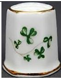
trellis shamrock hexagonal