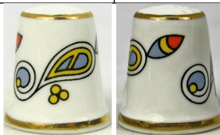
Celtic patterns Thimble Collectors Club green and gold maker's mark