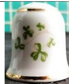
trellis shamrock flared rim