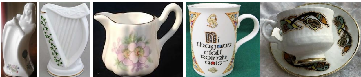
range of Royal Tara table and giftware figurine – Irish harp - jug with Irish flowers - mug and teacup with Book of Kells designs

They are quality thimbles, well made and if you collect china thimbles, please consider adding some of these for your collection.