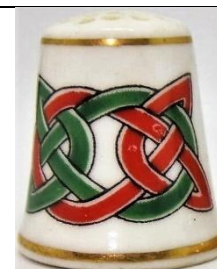
green with red Celtic pattern