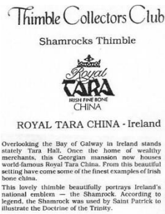
US club certificate (British certificates don't show the maker's mark)

Thimble Collectors Club (TCC) included two Royal Tara thimbles in the monthly thimbles that were issued to their members. They too were accompanied by a certificate.