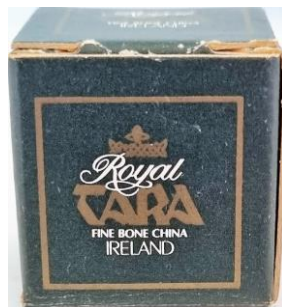
Royal Tara thimble box

Royal Tara cardboard thimble boxes bear the same mark as these thimbles.