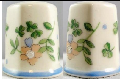
Laura trellis shamrocks with flowers hexagonal shape single blue trim green maker's mark