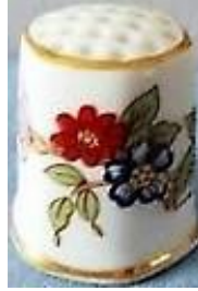
Floral hexagonal shape