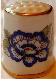
Harmony hexagonal shape blue maker's mark