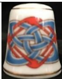
blue with red Celtic pattern green and gold maker's mark