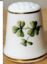
small sprig of trellis shamrock Thimble Collectors Club