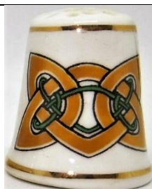
yellow-gold with green Celtic pattern