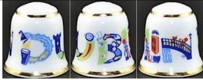
Dublin millennium (988-1988) flared rim