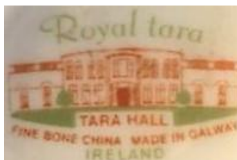
initial maker's mark

Their thimbles have a range of different maker's marks inside. The earliest mark is colourful in two tones: a tan image of Tara Hall, with small amounts of green, with the accompanying lettering in the same two colours.