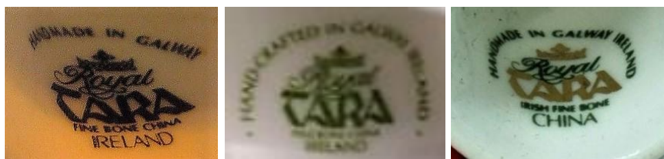
most commonly found Royal Tara maker's mark – R: no mention of IRELAND underneath