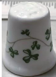
trellis shamrock traditional shape missing gold trims