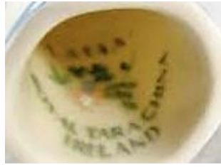
Laura thimble maker's mark

The following maker's mark is found on the 'Laura' thimbles. Shamrocks are incorporated in this maker's mark.