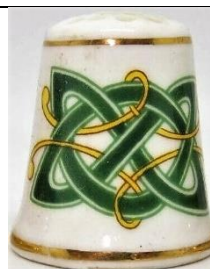
green with yellow Celtic pattern