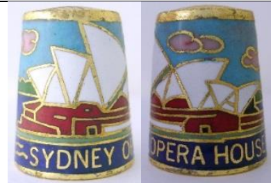
cloisonné (enamel and brass) Chinese 2000s