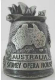
Exquisite Creations England pewter the lettering is on the body of the thimbles 1980s