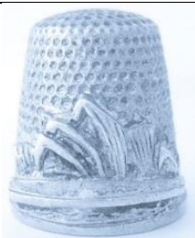
Zygmunt Libucha Brisbane sterling silver 1980s