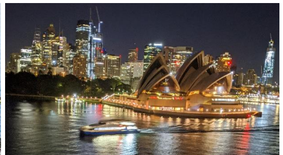
Sydney Opera House – Songlines 2016 | Sailing into Sydney Harbour at dawn March 2020