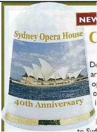
Sydney Opera House 40 th anniversary (2013) unmarked china