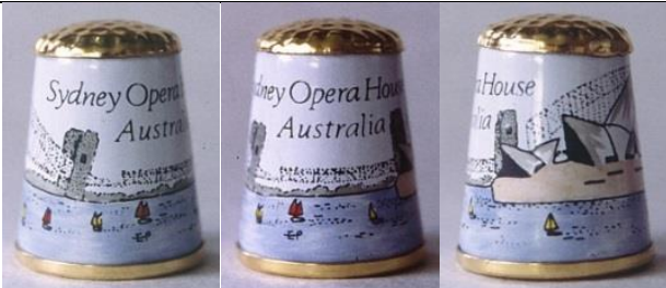
Crummles Enamels England enamel and brass commissioned by the Opera House shop 1980s?