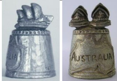
Stephen Frost of Warwick Models England pewter 1980s