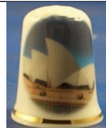
Birchcroft fine bone china