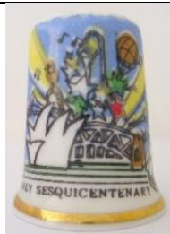
Birchcroft fine bone china Pan Arts of Sydney commissioned these thimbles for Sydney's Sesquicentenary (1847-1992) late 1990s part of Pan Arts Collectables Australia Series No. 28 1992