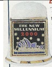
metal badge on china The new millennium 2000 limited edition of 2000