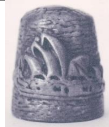
Pan Arts Pewter Sydney pewter 1989-1990s