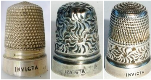
Invicta Silver thimbles