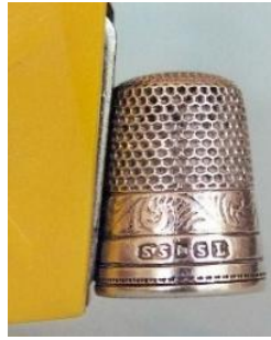
"AUSSIE" attracts a magnet