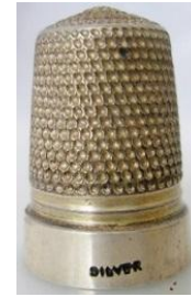
Silver on verso of Invicta