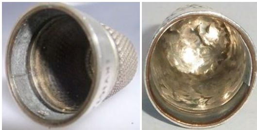
Invicta inner rims note copper showing at rim on right