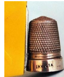
this Invicta attracts a magnet