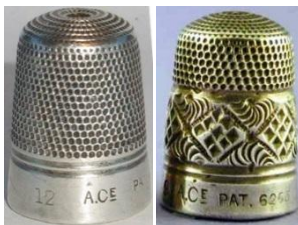
A.C.E rheumatism thimble PAT 6253 in 1909 Alfred Constantine - patentee