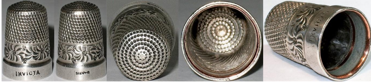
showing all aspects of one Invicta Silver thimble