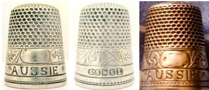
front of thimble

There is a possibility that the thimbles were not made in Australia - but commissioned for the Australian market. Its construction makes this a distinct possibility.