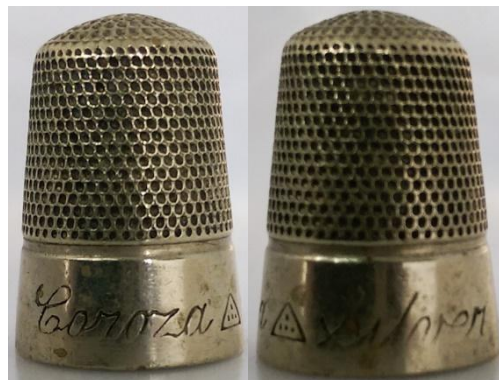
Coroza Silver wider band