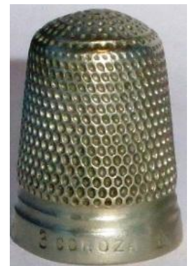
Coroza with different lettering on a narrower band