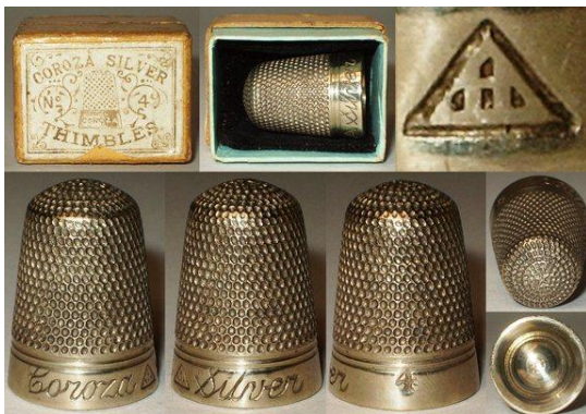
Coroza Silver Thimbles box