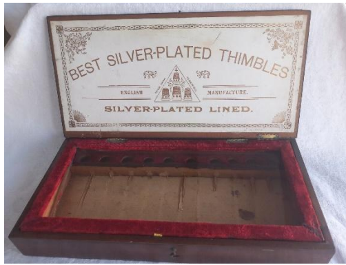
Best Silver-Plated thimbles showing the Registered Trademark with four thimbles