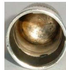
A.C.E inner rim