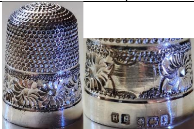
1905 band of daisies over stippled patterning above daisies