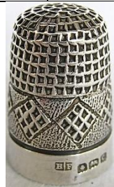
1902 diamond shapes within diamond band diamond pattern top half