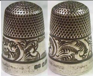
1901 R D 297020 band of acanthus large blank cartouche