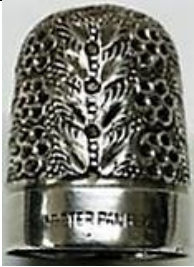
CU 1918 size 6 "PETER PAN REGD"