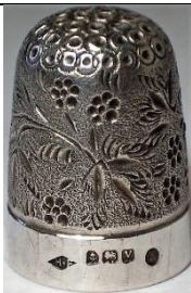
1920 size 5 blackberries all over