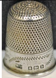
1901 band of wrigglework