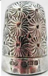
1903 daisies with deep centres