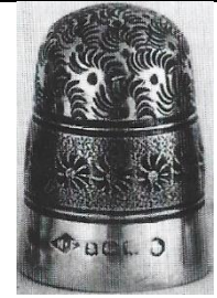
1921 size 6 daisies on top half single band of daisies on stippling