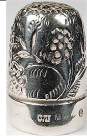
CU 1918 size 6 "PETER PAN REGD"