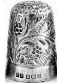
1905 blackberries with leaves, berries on apex