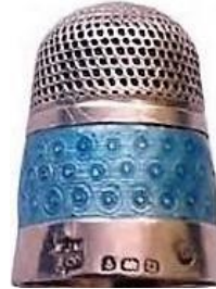
1919 size 6 WJM&Co