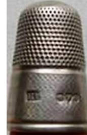
1882 taller Victorian shape with wide band with light diamond pattern