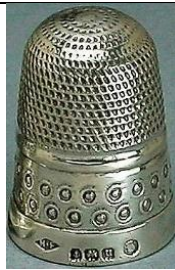
1919 size 5 two rows of circles