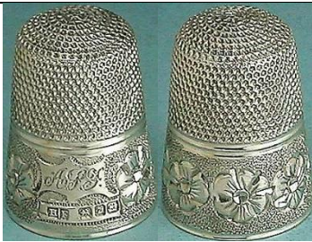
1899 band with fancy daisies design monogram in cartouche