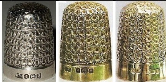
1900/1904/1905 blackberries all over