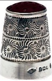
1920 two bands of daisies is the stone apex original?