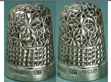
1901 R D 297020 band of diamond pattern strong daisies top