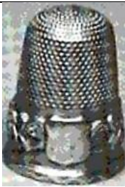
patterned band blank shield cartouche