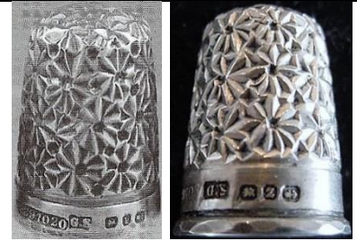
1897/1898 GS RD297020