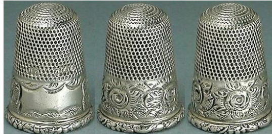
1882 this band of patterned roses became of of the signature designs for Samuel Foskett (1893-) patterned rim large blank cartouche with well-defined wavy edges