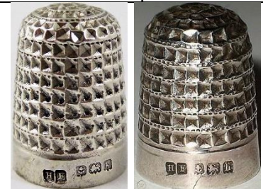
1906/1907 diamond pattern with dots