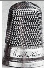
1875 Sovereign's Head (duty mark) engraved Emily Church in long narrow cartouche