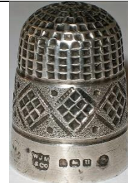
1920 size 3 WJM&Co