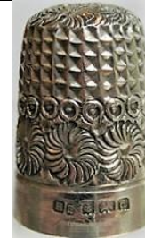
1903 band of daisies, circles row diamond pattern top