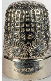
CU 1918 "PETER PAN REGD"