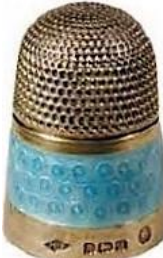
1919 size 6 band of blue enamelling