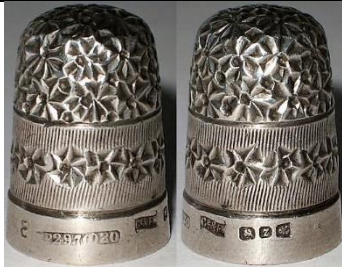
1899 C E F D size 8 RD297020