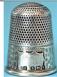
date letter illegible as stamped in edge of blank cartouche band of beaten patterning