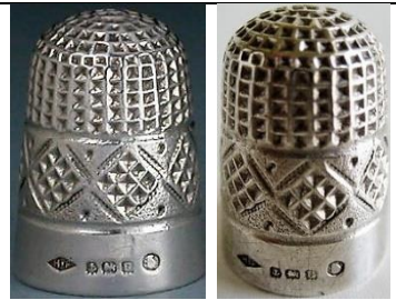
1919/1921 size 5, 9, 4 diamond shapes within diamond diamond pattern top half