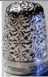
1904 GG size 4 RD297020