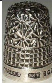
1900 WJH RD297020