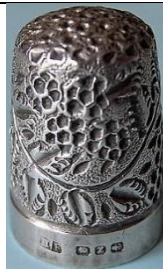
1899 blackberries and leaves with berries on apex