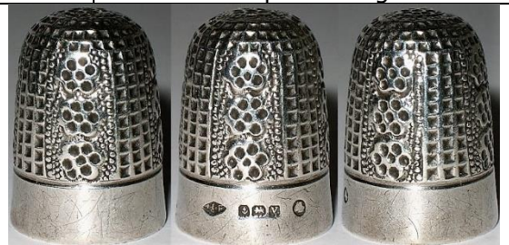
1920 size 4 vertical alternating panels of blackberries and diamond patterning