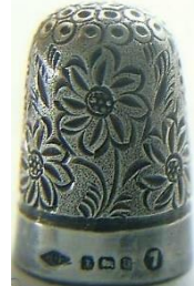
1919 size 7 blackberry flowers