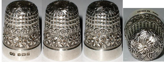
1903 composite patterning with most unusual row of 'swirling' chased daisies – different from traditional daisies on apex