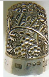
1899 RD297020 blackberries and leaves with berries on apex