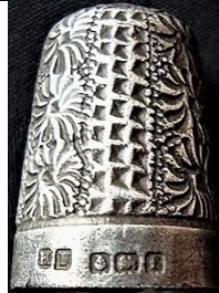
1905 vertical alternating panels of daisies and diamond pattern