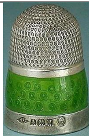
1920 size 6 band of green enamelling