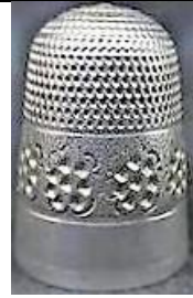
1921 band of blackberries above wide plain band