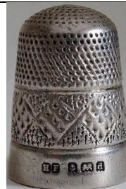
1905 diamond shapes within diamond