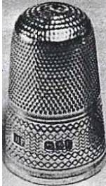
1881 taller Victorian shape with band with zig-zag patterning