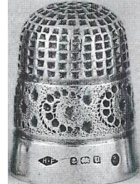
1919 size 8 band of moons and stars with diamond patterning above