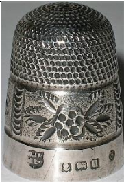
1919 size 6 WJM&Co