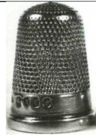
1879 Sovereign's Head (duty mark)