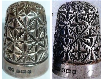
1904/1907/1909 all over 'cushion' pattern