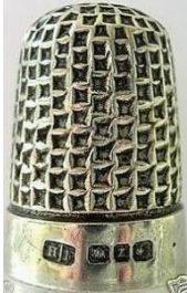
1899 strong diamond pattern