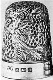
1903 clumps of blackberries with leaves, berries on apex