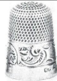
1904 acanthus band