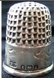
1900 band of wrigglework strong diamond pattern top