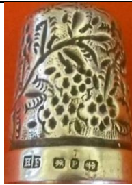
1914 blackberries and leaves