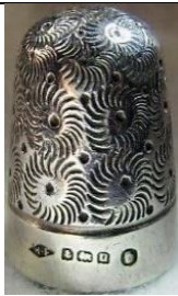
1919/1920 size 5, 6 daisies