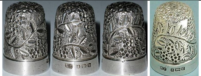
1901/1904 blackberries with leaves, berries on apex