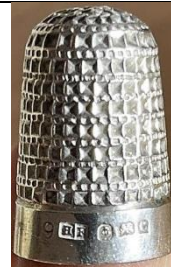
1902 diamond pattern with dotted row between