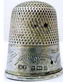
1900 band of wrigglework