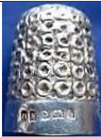
1907 rows of blackberries