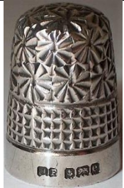
1904/1905 band of diamond pattern strong daisies top