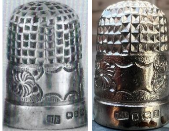
1899/1900 diamond pattern with band of daisies