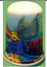
Paddington Bear with building