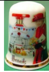
QEII's diamond jubilee 2012