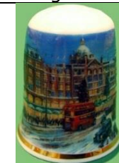
building with bus