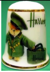
doorman bear Harrods china