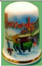
building with van