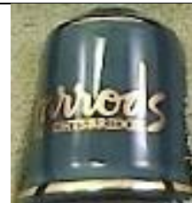
blue - different shape