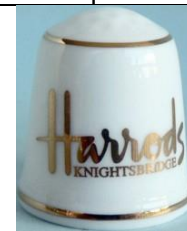
white - different shape