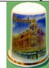
building in colour