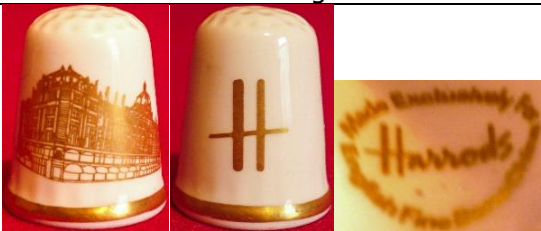
building gold 'Made exclusively for Harrods'