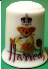
bear with crown