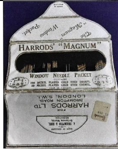
Harrods Ltd "Magnum" window needle packet