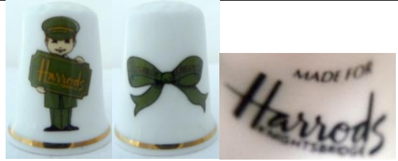
doorman with 'Knightsbridge' as part of the backstamp