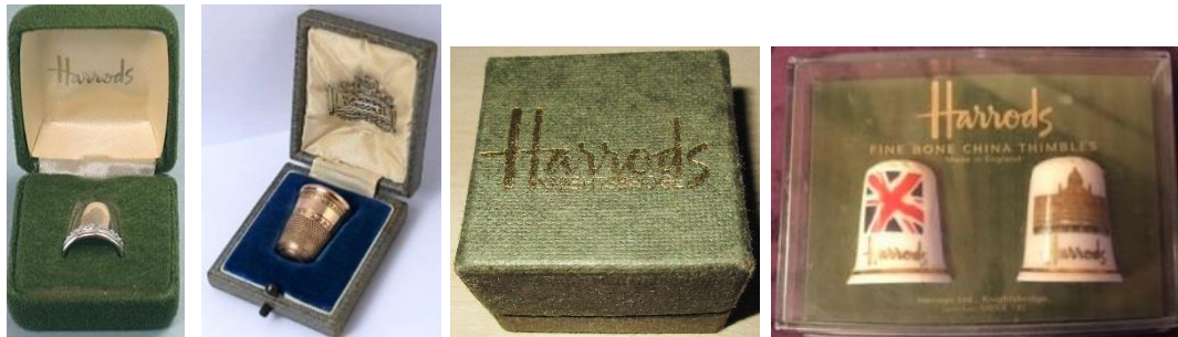
Harrods thimble boxes

Some of the thimbles have the word 'Knightsbridge' lettered under 'Harrods'. The brand name is always identical, tho the distinctive 'H' is often used in conjunction with the brand name.