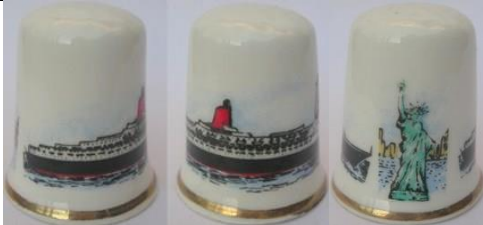
QEII liner with Statue of Liberty on verso 'Made for Harrods Knightsbridge'