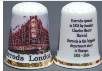
Harrods London 150 years of establishment of Harrods 1834-2014