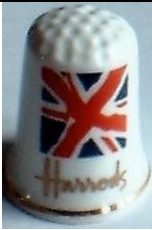
stylised Union Jack