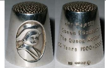
Peter Ladell (PL) sterling silver