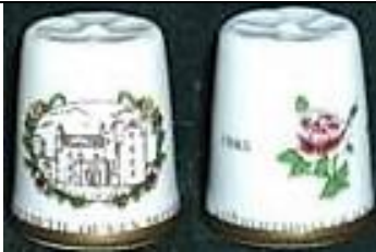
Caverswall china self-patterned apex