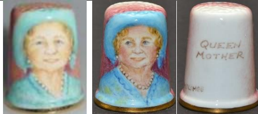
Dunheved handpainted bone china Sheila Whitcombe