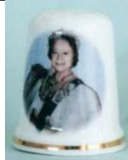
St George fine bone china