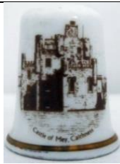
Meycraft fine bone china