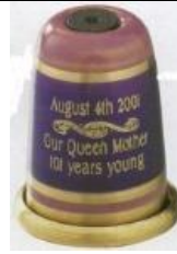
Woodsetton Peeps lacquered brass ... our Queen Mother 101 years young