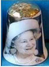
Birchcroft china from Royal Ladies set