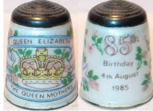
James Swann & Son sterling silver & enamel