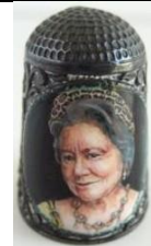
Peter Swingler (PS) sterling silver & handpainted enamel