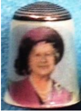
James Swann & Son sterling silver & enamel