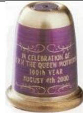
Woodsetton Peeps lacquered brass