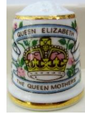
Sutherland/Scotland Direct china