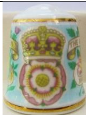
Sutherland china commemorating 50 years since coronation 1987