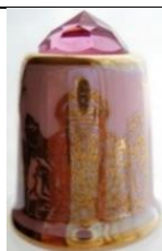
Sutherland china purple Swarovski crystal in apex