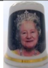
Fenton fine bone china