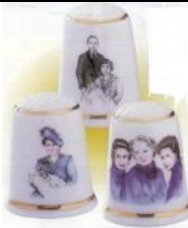
Julie Menzies china (decal) set of three