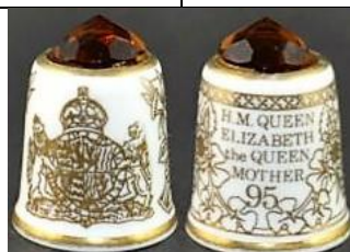
Sutherland china amber Swarovski crystal in apex