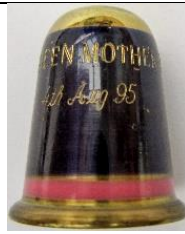
Woodsetton Peeps Queen Mother 95 4 Aug 95 lacquered brass limited to 950