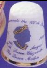
Museum Collections china