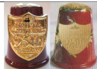
Felix Morel Bath lacquered brass & gold-plated limited to 450