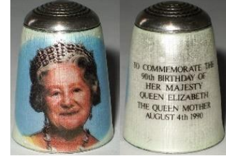
Swann Thimbles/James Swann & Son sterling silver & enamel