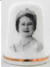
St George fine bone china 63 rd birthday