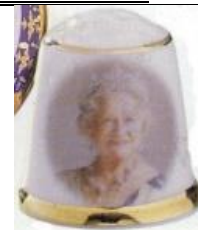
Museum Collections china