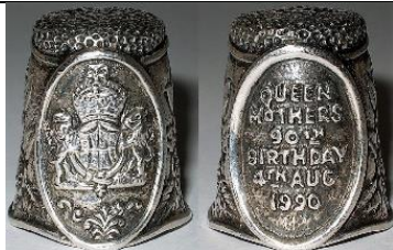
Hamilton & Inches (H&I) sterling silver (made by Deakin & Francis) limited to 475