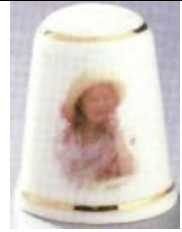
fine bone china