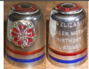
Deakin & Francis (D&F) sterling silver & enamel