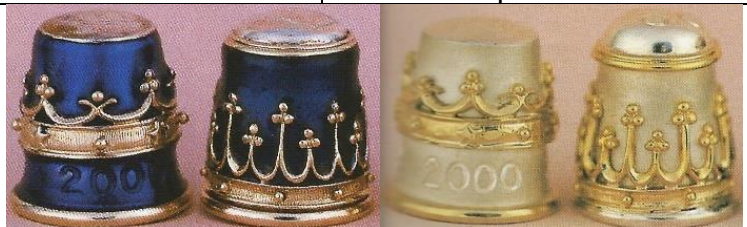
enamelled sterling silver & 18ct gold pairs Queen Mother Commemorative Year 1900-2000 on apex (R) commissioned by Thimble Society of London