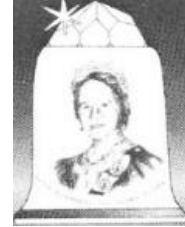
Theodore Paul fine bone china b&w photo