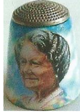
Peter Swingler (PS) sterling silver & handpainted enamel