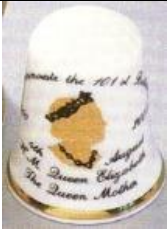
Museum Collections china