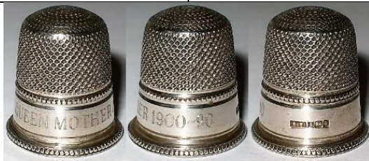
Swann Thimbles (S(T))