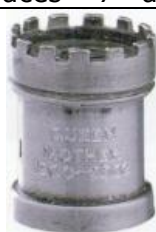
Woodsetton Peeps pewter