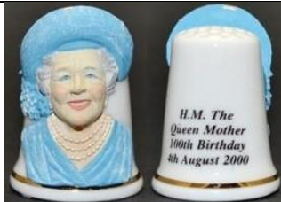
Sterling Classic china & resin