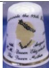
Museum Collections china