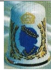
fine bone china laurel leaf limited to 2000