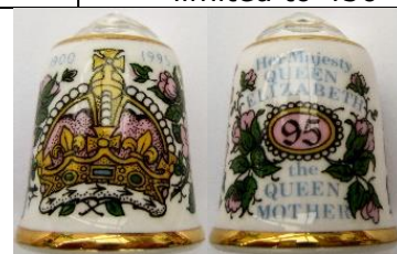
Sutherland china clear Swarovski crystal in apex