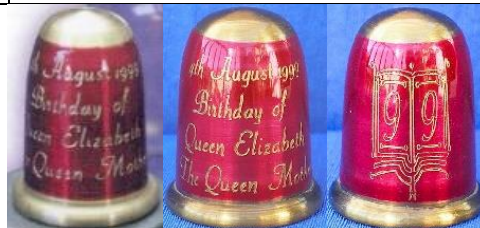
Woodsetton Peeps Lorraine Bates lacquered brass