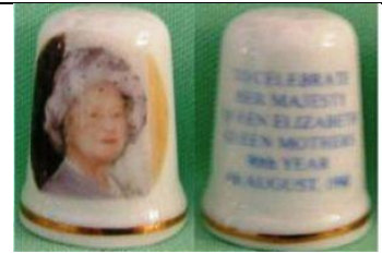
St George fine bone china