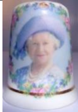
Fenton/Babbacombe China/Blue Waters fine bone china