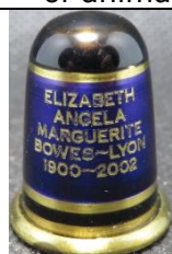
Woodsetton Peeps lacquered brass Elizabeth Angela Marguerite Bowes Lyon 1900-2002

1 st as a child – 2 nd a royal bride – 3 rd a doting mother - 4 th a morale boost during the blitz – 5 th a lover of animals – 6 th a day at the races – 7 th a royal grandmother - 8 th a centenary birthday