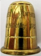
Woodsetton Peeps brass