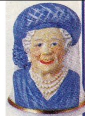
Connoisseur Collectables china & resin