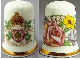
ASL fine bone china