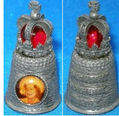
Stephen Frost/Warwick Models pewter with red plastic bead in crown