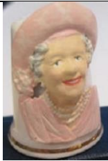
Connoisseur Collectables china & resin