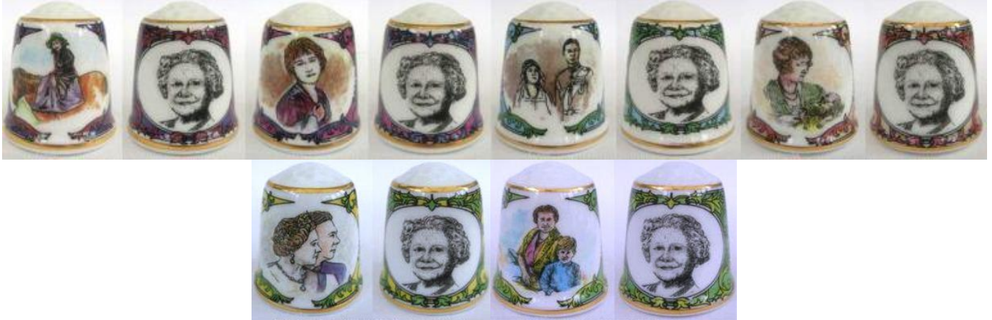
Sutherland china set of six