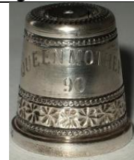
Swann Thimbles (S(T))

this is one of a pair: a matching small size for Princess Eugenie's birth 1990