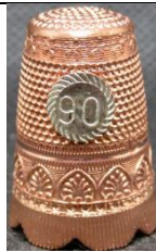
Settmacher copper with applied 90 disc