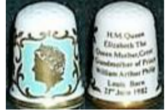
Caverswall china birth of Prince William Queen Elizabeth the Queen Mother becomes a great-grandmother