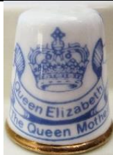
Highland China fine bone china