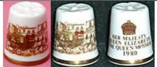
Caverswall china self-patterned apex