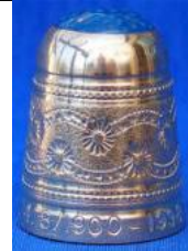
Swann Thimbles (S(T)) sterling silver slate apex marked '1990-1998'