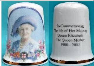
fine bone china with her coat-of-arms incorporated in design