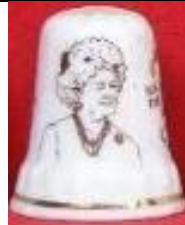
Mount Royal china