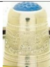
Swann Thimbles (S(T)) sterling silver stone apex