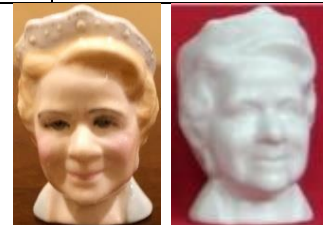
Sutherland handpainted china