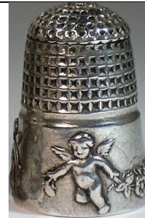
1906 CH diamond blackberry apex