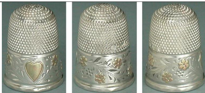
1894 GWH&Co (for George Hatton & Co) plain faceted rim