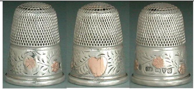
1901 CH plain rolled rim well used and not as ornate