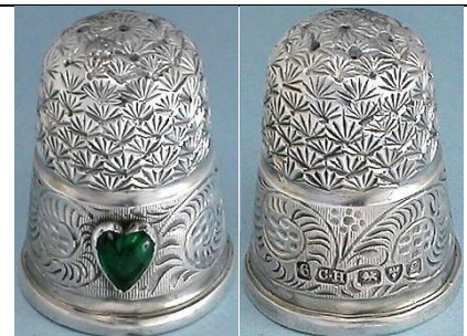
1904 CH #6 green stone shell rolled rim