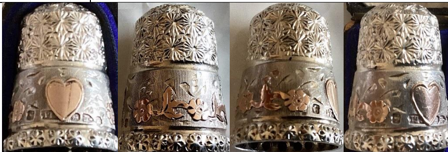
1895 JT&S (for John Thompson & Sons) Princess May embossed Louise rim