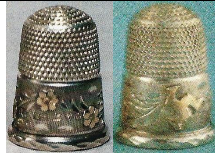
1901 CH #10 plain faceted rim instead of a gold heart, this example has the Isle of Man triskelion (three-legged symbol)