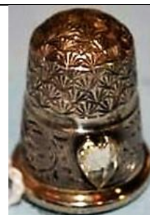
1906 CH this thimble is missing its stone heart I have wondered what is below the heart is too indistinct to really know patterning around the band does seem slightly different? shell rolled rim