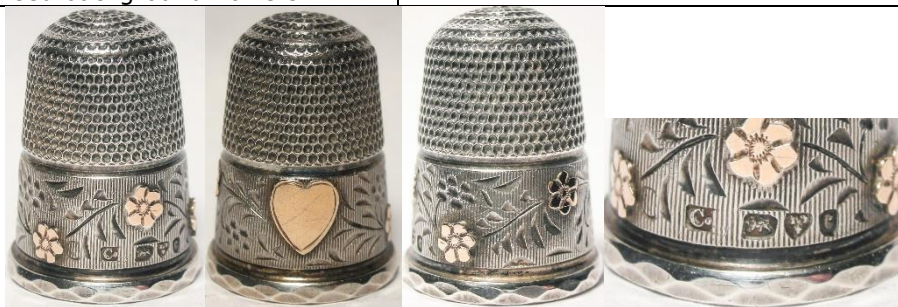
1903 C&Co (for Carrington & Co) #8 plain faceted rim