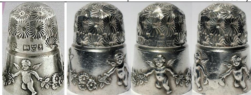
1906 CH #11 daisy