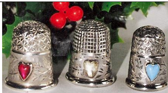
CH pink - citrine - turquoise Louise - diamond - shell rolled rims