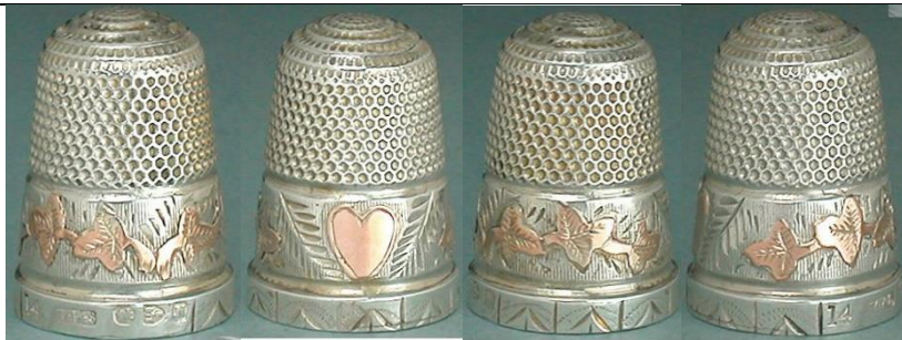
1896 Henry Griffith & Sons Chester #14 plain gold heart with a spray of raised gold ivy leaves flat rim with patterning

I would have sworn I'd never seen similar heart thimbles by other English thimble makers, other than Horner. How wrong could I be? During Victorian times thimble makers copied designs from their rivals.