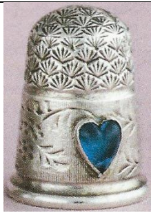
1919 CH blue stone shell rolled rim