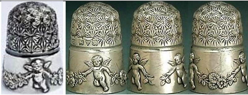
1906 CH Princess May