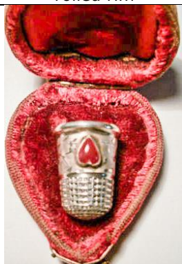
1906 CH opaque red stone diamond rolled rim