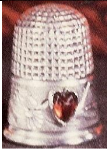
CH brown-red stone diamond there are daisies on the band rolled rim