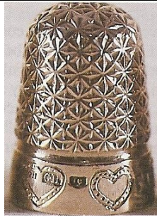
9ct gold CH #10 hearts with dots in border engraved around band Louise + R D 127211