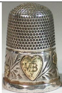
1890s CH plain faceted rim with 'MB' monogram