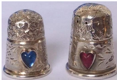
two gleaming glass hearts

I am sure you would agree that these are the stepchildren of the CH heart thimbles? There don't seem to be as many made and none of this type of thimble was offered for sale by the TSL in their Horner edition in 1990. The rims aren't as ornate as the gold heart thimbles. The addition of the etched/engraved swallows is certainly different.