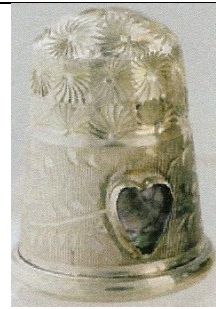
1905 CH amethyst stone daisy rolled rim