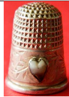
CH opaque green stone diamond rolled rim