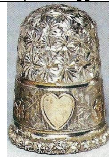
1902 CH #8 Princess May embossed Louise rim