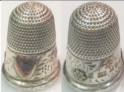
1901 CH #9 plain faceted rim