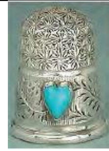
CH turquoise Princess May rolled rim