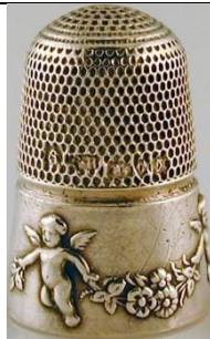
9ct gold CH #6 plain

I can't end this Horner thematic topic without sharing these thimbles – call them cupids or cherubs they do belong with hearts ... two cupids with garlands of flowers around the band