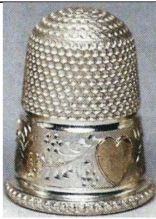
1900 CH #7 plain beaded rim