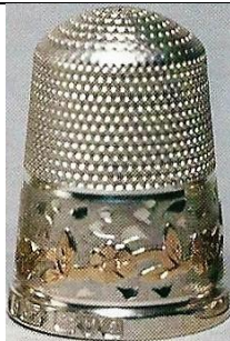
1902 CH #6 plain a spray of raised gold ivy leaves replaces the gold roses and stylised background flowers