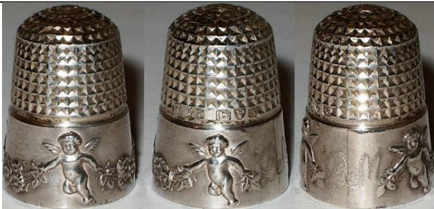
1901 CH diamond