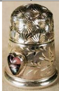
CH purple stone daisy showing one of the swallows rolled rim