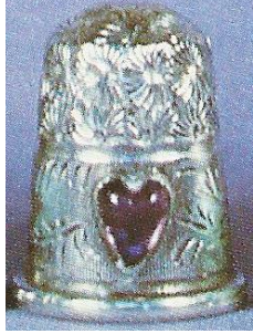
1905 CH #10 amethyst stone daisy rolled rim