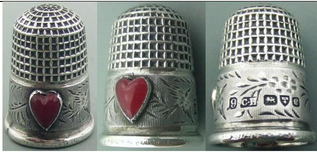
1904 CH #9 pinky-purple stone – possibly carnelian diamond showing swallows some type of patterning on rim