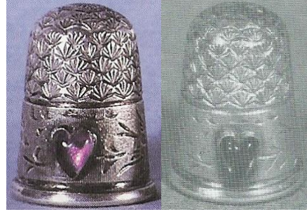
1905 CH purple/amethyst stone shell rolled rim R: b&w photo