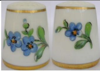
TCC's Classic Selection