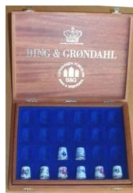
B&G thimble display box