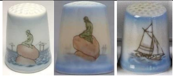
TCC's The Little Mermaid from 1985