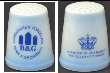
TCC's Hallmarked thimbles from set of 50 1985