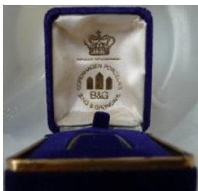
B&G thimble box