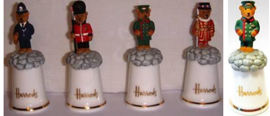
Sterling Classic 'Harrods' lettered inside R: unbranded