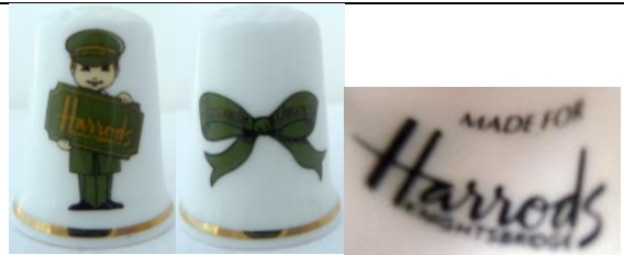
doorman with 'Knightsbridge' as part of the backstamp