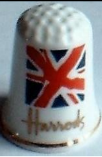
stylised Union Jack