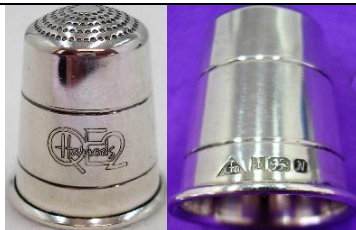
TLtd Birmingham 1987 QE2 (Cunard cruise liner) around the Harrods lettering