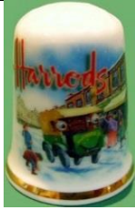
building with van