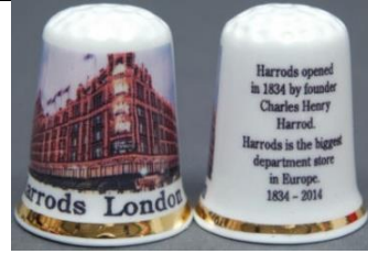
Harrods London 150 years of establishment of Harrods 1834-2014