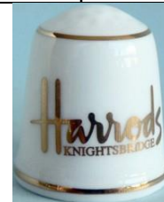
white - different shape