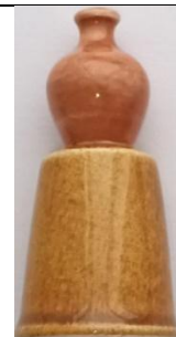
Vase handpainted pottery vase is 2cm ochre thimble TTG July 1985