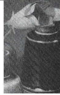
no lettering TTG July 1985 (shown in background) b&w photo