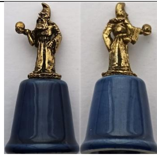
Merlin brass finish no lettering also available in silver 5 gold 1 TTG December 1985