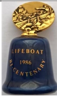
Lifeboat gold-plated medallion 'Lifeboat Bi-centenary 1986' TTG April 1986