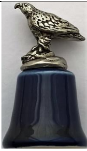
Eagle no lettering