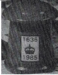
Pillar box red 1635-1985 350 years of Post Office limited to 500 TTG July 1985 b&w photo