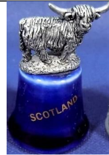
Highland cow 'Scotland'