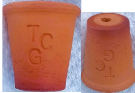
Pot red plant pots 'TCG' pots even have drainage holes TTG April 1985