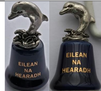
Dolphin splash plinth 'Eilean na Hearadh' (name of a guesthouse)