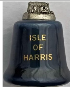
Croft 'Isle of Harris'