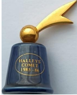
Halley's Comet gold-plated comet 'Halley's Comet 1985-86' lettered in elliptical shape of comet's path TTG November 1985