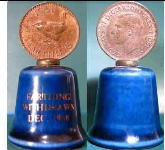
Coin genuine copper coin 'Farthing withdrawn Dec. 1960' limited to 450 TTG December 1985