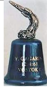
Rocket rubble depicting Earth plinth 'Y. Gagarin 4.12.61 Vostok 1'