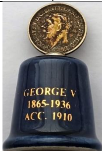
Coin genuine silver 3d coin 'George V 1865-1936 Acc. 1910' commemorating 50 years since his death TTG January 1986