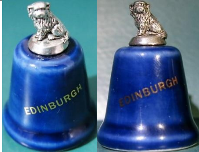
Blackfriars Bobbie 'Edinburgh'