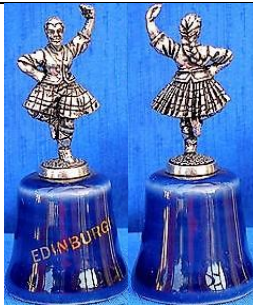
Highland dancer 'Edinburgh'