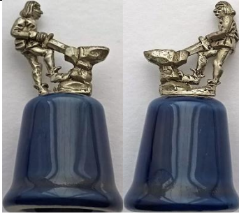
Young Arthur with Escalibur no lettering TTG March 1986