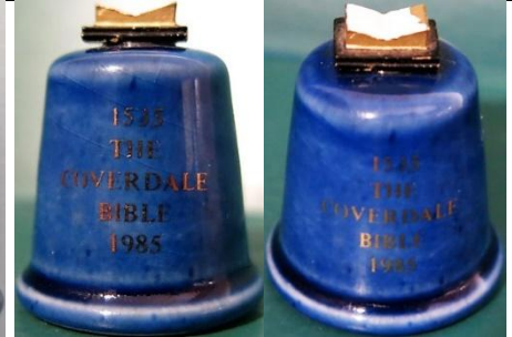
Book book is edged in gold '1535 The Coverdale Bible 1985' celebrating 450 years since its creation mahogany wooden plinth for book by Nick Kerr TTG October 1985