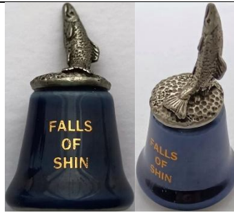
Fish speckled plinth of salmon 'Falls of Shin'