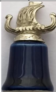
Ship waves plinth Viking longboat no lettering