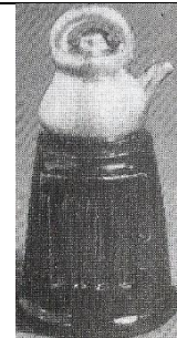
Kettle enamelled copper black thimble representing a stove no lettering TTG May 1985 b&w photo