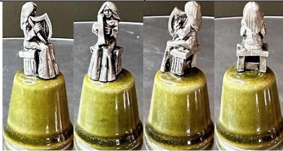
Harpist green thimble