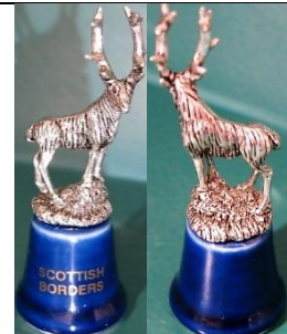
Stag 'Scottish Borders'