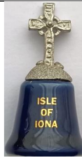
Celtic Cross raised mound plinth 'Isle of Iona'