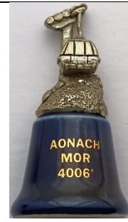
Gondola mountain plinth 'Aonach Mor 4006'