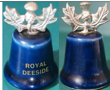
Thistle 'Royal Deeside'