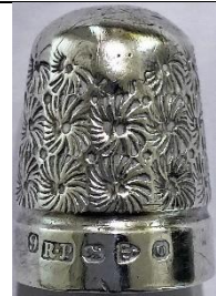
1911 #9 badly repaired apex