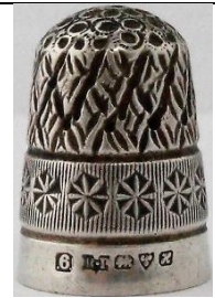
1910 #.6. Horner is the only maker to use this size marking but the patterning looks like Foskett