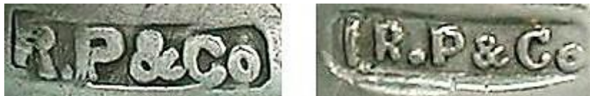
marks on steel-cored sterling silver thimbles