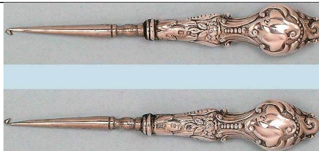
Crochet hook Birmingham 1905