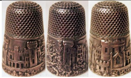
not assayed Windsor Castle