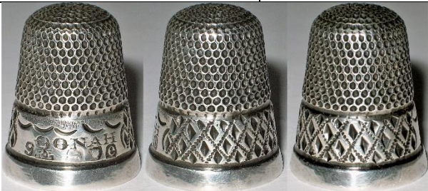
1900 #9 inscribed OONAH