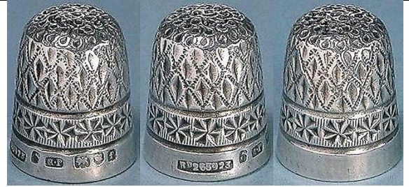
1900 #6 RD265923