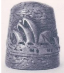
Pan Arts Pewter Sydney pewter 1989-1990s