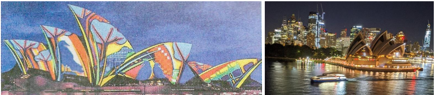
Sydney Opera House – Songlines 2016 | Sailing into Sydney Harbour at dawn March 2020

I have grouped the thimbles in the order that they appear in my book (ie by what they are made of). As I don't own all of these thimbles, if you have better or clearer photos, please share.