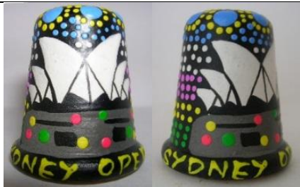
Indonesian handpainted in dot-painting 2000s