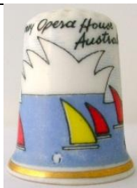
Pan Arts Collectables bone china Special Series No. 1 (not lettered on thimbles) commissioned by the Opera House shop mid 1980s