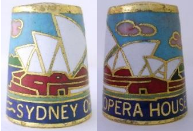
cloisonné (enamel and brass) Chinese 2000s