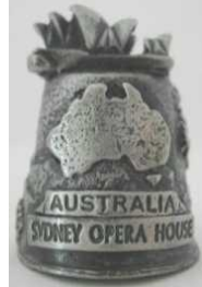
Exquisite Creations England pewter the lettering is on the body of the thimbles 1980s