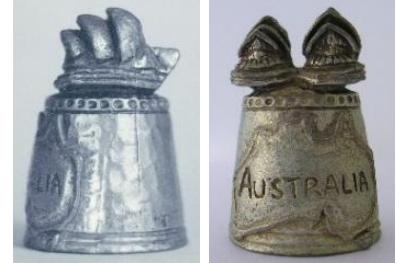
Stephen Frost of Warwick Models England pewter 1980s