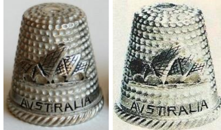
Riccardo's Pewter Sydney pewter some examples show cross-hatching to show the roof tiles 1980s