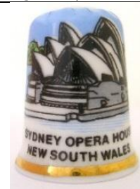
Pan Arts Collectables bone china Australia Series No. 20 1980s