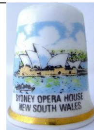
Pan Arts Collectables bone china Australia Series No. 6 mid 1980s