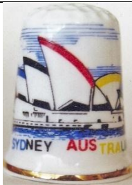
Pan Arts Collectables bone china Australia Series No. 35 produced when Sydney won Olympics, using the Olympic colours 1990s