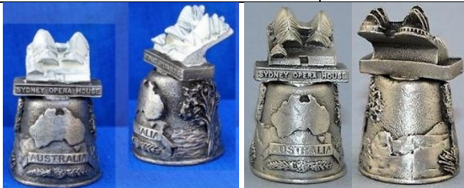
Wales Association of Pewter Works (WAPW) handpainted and plain pewter the lettering is under the icon