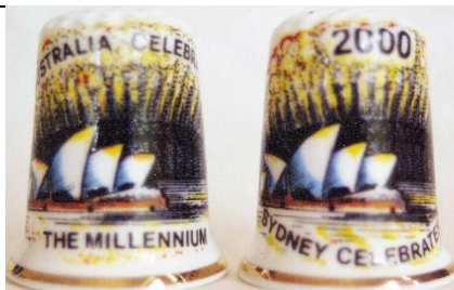
Pan Arts Collectables bone china Australia Series No. 40-41 (not lettered on thimbles) pair of similar thimbles Left: Australia celebrates the Millennium right: Sydney celebrates 2000 2000