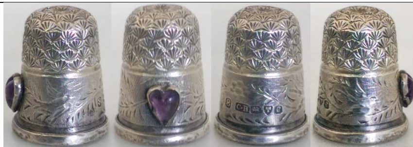
1904 CH #8 amethyst shell showing two swallows rolled rim

There is room for debate – are these real semi-precious stones or just coloured glass? I would welcome your opinion. I don't know anything about the type of stones, so I have used the dominant colour as description, unless described elsewhere as such.