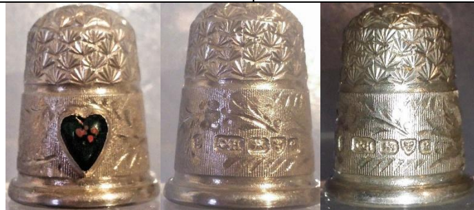
1905 CH #9 bloodstone shell rolled rim