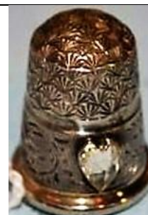
1906 CH this thimble is missing its stone heart I have wondered what is below the heart is too indistinct to really know patterning around the band does seem slightly different? shell rolled rim