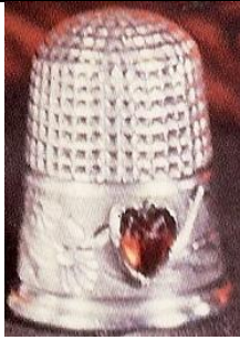
CH brown-red stone diamond there are daisies on the band rolled rim