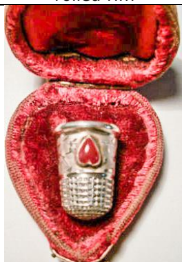
1906 CH opaque red stone diamond rolled rim