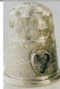
1905 CH amethyst stone daisy rolled rim