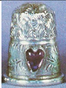
1905 CH #10 amethyst stone daisy rolled rim