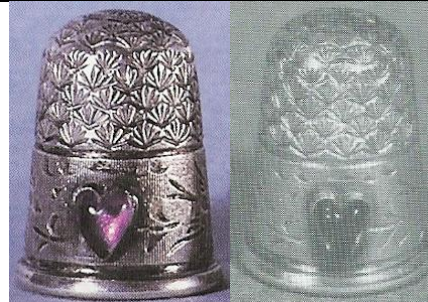
1905 CH purple/amethyst stone shell rolled rim R: b&w photo