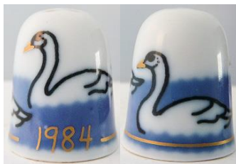
1984 swans limited to 5000 pieces