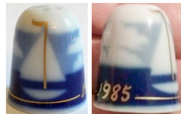
1985 yacht at sea