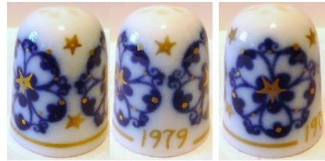
1979 limited to 5000 pieces