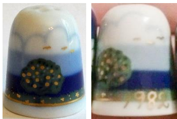
1982 tree at sea limited to 5000 pieces