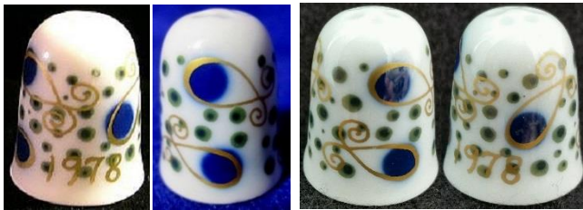
1978 with touches of green