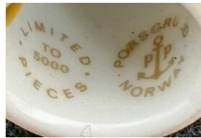
Porsgrund maker's mark together with their limited edition of 5000 pieces mark

When the late 1970s collectables thimbles market took off, Porsgrund joined the fray and produced high quality annual thimbles - with the main colours being gold and blue. Again, like many other porcelain houses, their run was short. I can find no other Porsgrund thimbles - they weren't featured in either of the Porcelain Houses set of 25 nor the Hallmarked set of 50 Porcelain Houses of the World. There are no Thimble Collectors Club (TCC) issues either. So, another Scandinavian niche quality set to source!