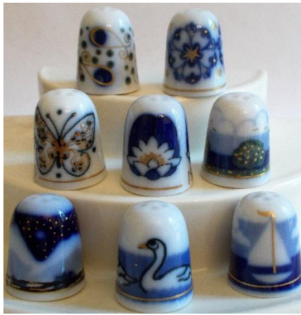
set of eight annual Porsgrund thimbles 1978-1985