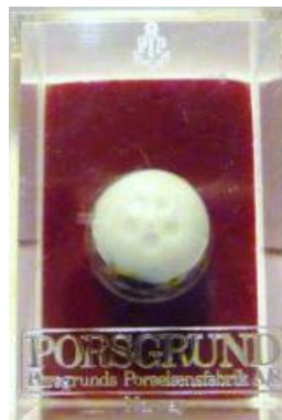
Porsgrund Porselensfabrik thimble box this view of the thimble apex shows the distinctive pattern of widely-spaced sparse indentations