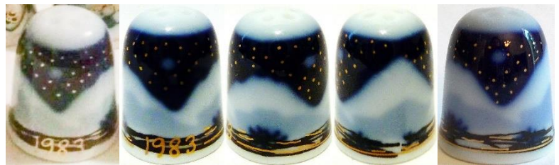
1983 stars limited to 5000 pieces