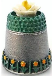
rose yellow flowers indents below flower also painted