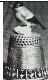
Blackbird TTG August 1985 b&w photo