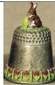
rabbit with lettuce red flowers