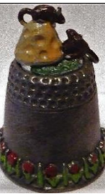
mice with cheese red flowers