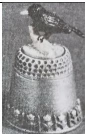
Blackbird Gibbons named as maker TTG February 1985 b&w photo