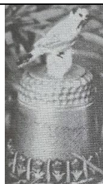
Jay TTG September 1985 b&w photo