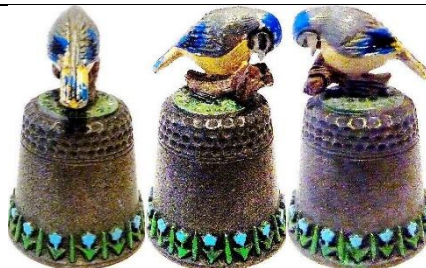
Blue Tit on branch blue flowers TTG December 198r