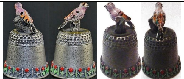
Linnet red flowers R: plinth unpainted TTG October 1985