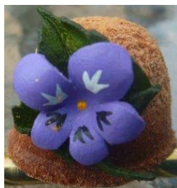
Yukon Territories Fireweed