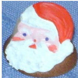
Christmas – Santa