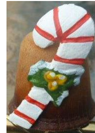
Christmas – Candy Cane