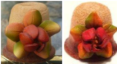
Newfoundland Pitcher Plant