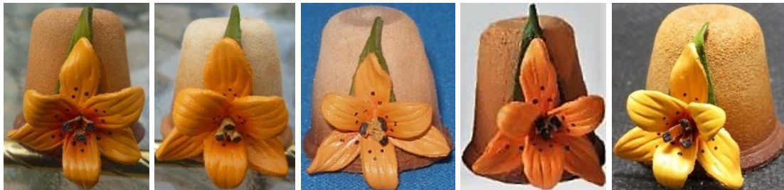
Saskatchewan Prairie Lily