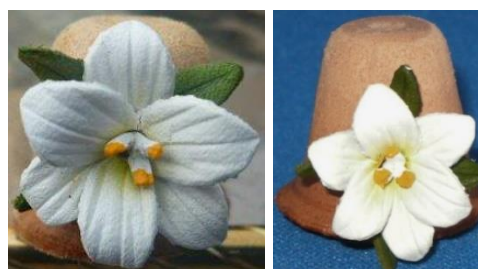
Quebec Madonna Lily