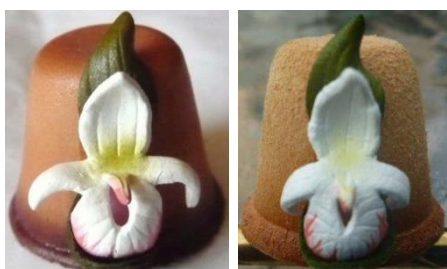
Prince Edward Island Lady Slipper