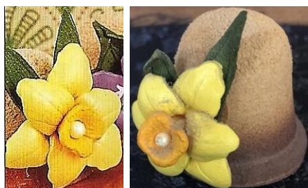
Daffodil with pearl at centre