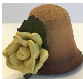
yellow bigger leaf