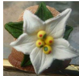
Poinsettia - White