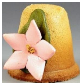
Nova Scotia Mayflower