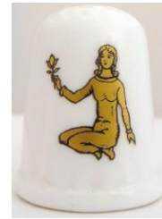
Virgo ridged rim