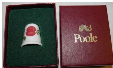
Poole Pottery box - ii