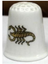
Scorpio ridged rim