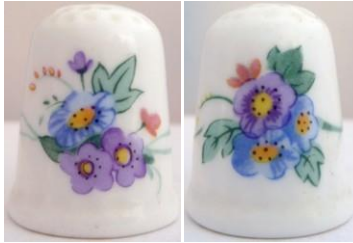
Cymbeline ridged rim