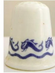
dolphins band using their logo