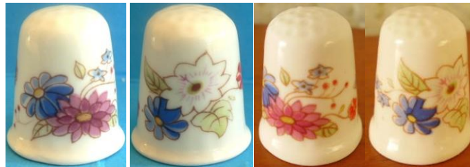
their traditional painting colour variation R