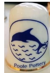
Poole Pottery newer blue backstamp