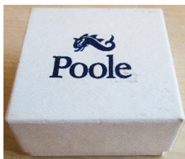
Poole Pottery box - i