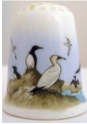
Seabirds Thimble Collectors Club