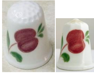
Country Berries based on their Cranbourne dinnerware pattern Thimble Collectors Club [L] different shape [R] - none -TCC