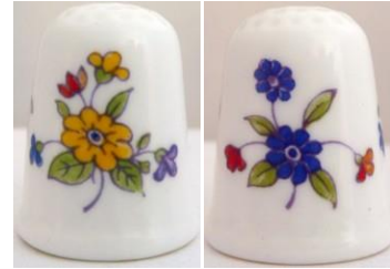
their traditional painting ridged rim