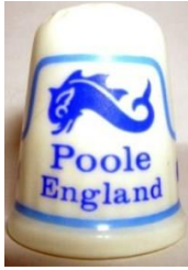
The Hallmarked Thimbles of the World's Great Porcelain Houses featuring their dolphin logo