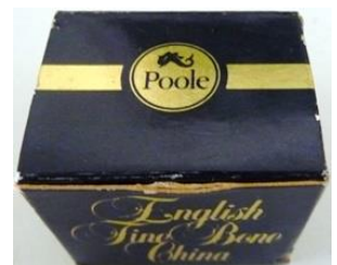
Poole Pottery box - iii