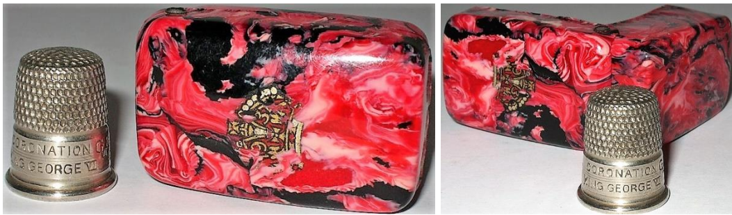
box lettered: HM 1937 gold crown Iles & Gomms celluloid rectangular thimble box