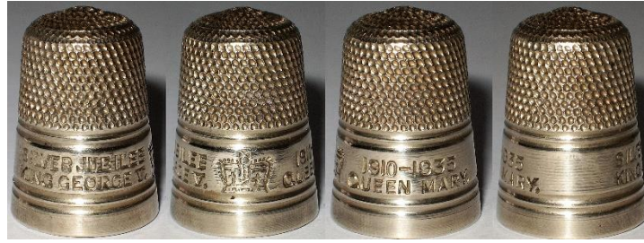
Silver Jubilee 1910-1935 King George V. Queen Mary. a crown Iles & Gomms no rolled rim