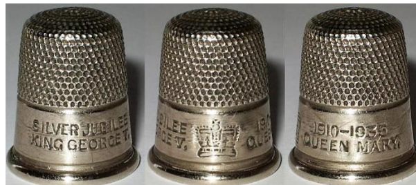
Silver Jubilee 1910-1935 King George V. Queen Mary. a crown Iles & Gomms nickel rolled rim