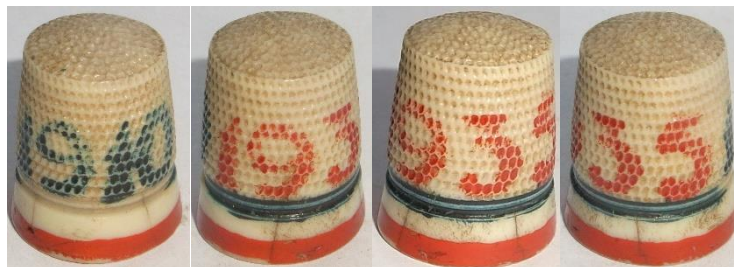
1910-1935 Iles & Gomms ivorine handpainted lettering in blue and red blue, white and red bands at rim