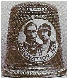
Coronation 1937 paper with portraits in a raised roundel Settmacher