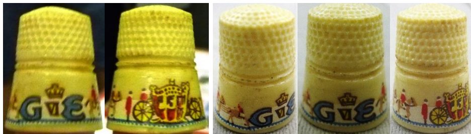
GVI E decaled scene with Coronation coach with George VI's royal cypher Iles & Gomms ivorine blue wavy line