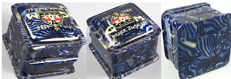
box lettered: 1910-1935 GM Silver Jubilee red and gold crown Iles & Gomms celluloid square thimble box