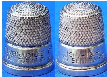
Silver Jubilee 1910-1935 King George V. Queen Mary. a crown nickel Iles & Gomms flat rim