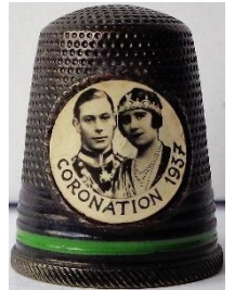
Coronation 1937 paper portraits in a raised roundel Settmacher oxidised brass yellow or green lacquered grooves