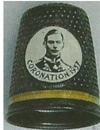
Coronation 1937 paper portrait in a raised roundel George VI only Settmacher oxidised brass yellow lacquered groove