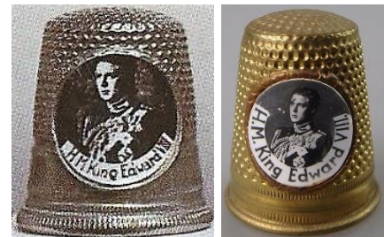
H.M. King Edward VIII. paper portrait in a raised roundel Settmacher L: zinc - R: brass