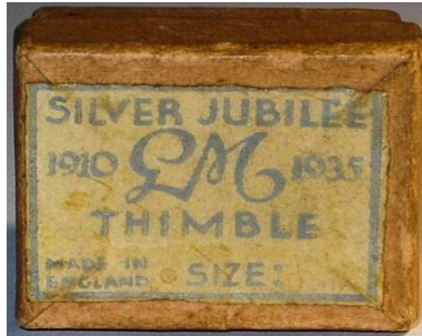
Silver Jubilee 1910-1935 King George V. Queen Mary. bust portraits Iles & Gomms nickel rolled rim box lettered: Silver Jubilee 1910 GM 1935 Thimble Made in England Size 2