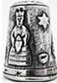
1984 Birmingham Christmas 1984 with Three Wise Men