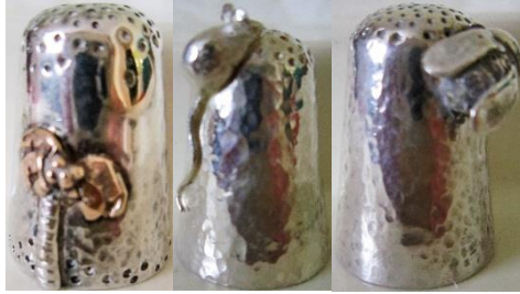
London applied gilt leafed plant, mouse and bee hand-beaten surface