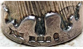
1977 L: jubilee mark Birmingham