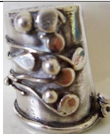
London applied stylised flowers with pearls