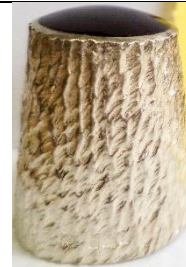
1989 Sheffield Onyx