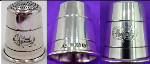
1987 Birmingham HARRODS lettered over QE2 (Cunard cruise liner)