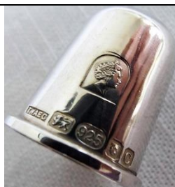
2002 925 London commemorating Queen Elizabeth's golden jubilee