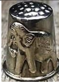
1996 925 London import mark applied elephant made in Thailand