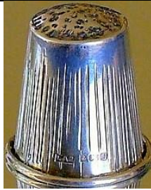
1985 Birmingham blue enamelling