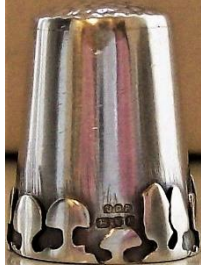
1957 London stylised trees design at rim rare date for this period