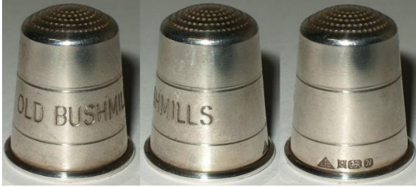
1987 Birmingham OLD BUSHMILLS