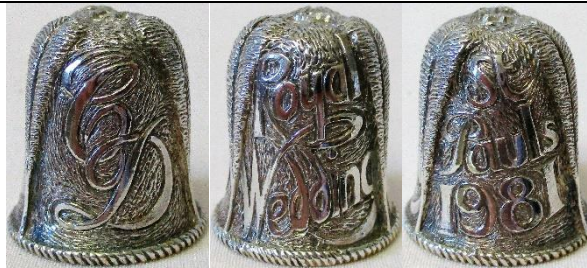
1981 London CD Royal Wedding St Paul's 1981