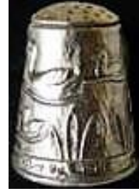
1984 Birmingham Easter 1984 swimming ducks