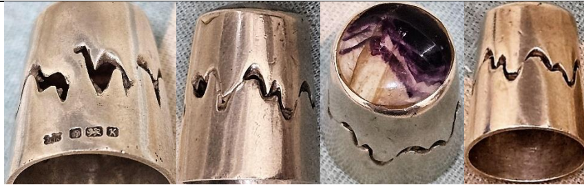
1984 Sheffield Blue John