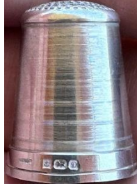
1979 Birmingham plain brushed surface mark poorly struck