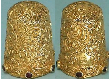
1978 9ct - 9.375 London garnets set in around rim