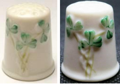
shamrock Thimble Collectors Club (TCC)