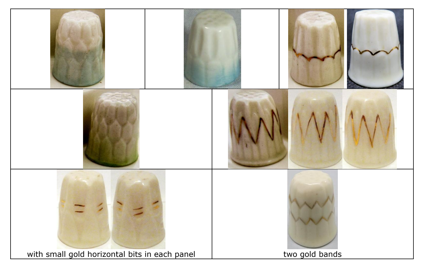
Others fluted abstract patterning on mottled ground all have green maker's mark