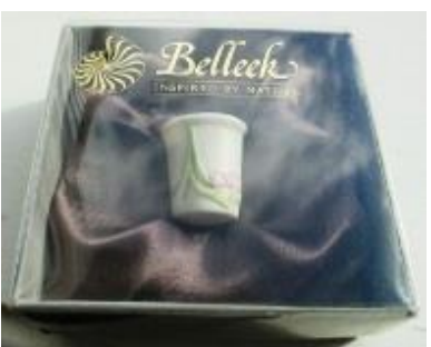
Belleek thimble box Inspired by Nature