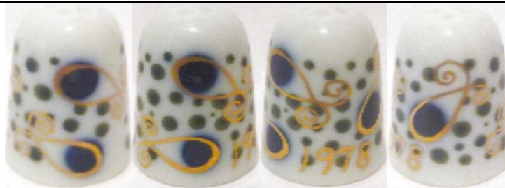
1978 with touches of green