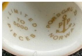
Porsgrund maker's mark together with their limited edition of 5000 pieces mark

When the late 1970s collectables thimbles market took off, Porsgrund joined the fray and produced high quality annual thimbles - with the main colours being gold and blue. Again, like many other porcelain houses, their run was short. I can find no other Porsgrund thimbles - they weren't featured in either of the Porcelain Houses set of 25 nor the Hallmarked set of 50 Porcelain Houses of the World. There are no Thimble Collectors Club (TCC) issues either. So, another Scandinavian niche quality set to source!