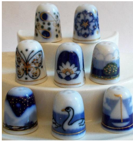
set of eight annual handpainted Porsgrund thimbles 1978-1985 limited to 5000