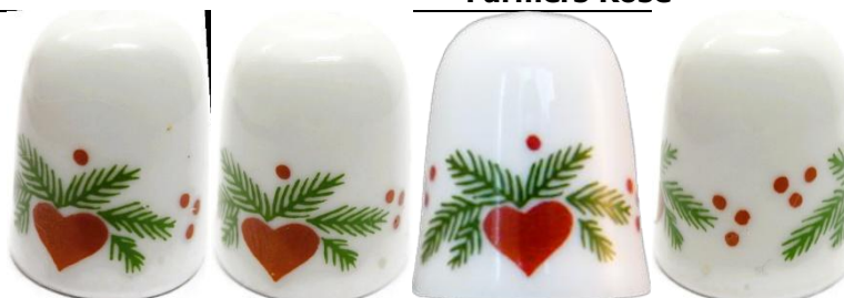
Hearts and Pines designer: Grete Rønning from design used on their dinnerware 1979