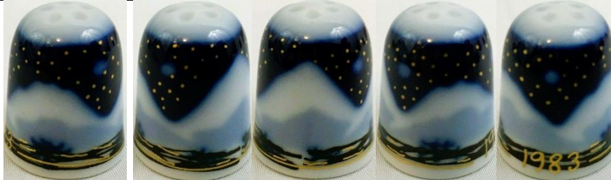
1983 starry night