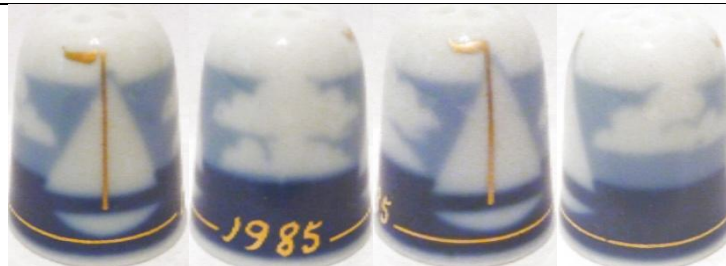
1985 yacht at sea