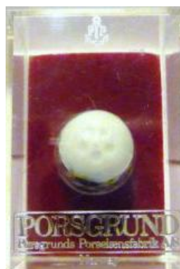
Porsgrund Porselensfabrik thimble box this view of the thimble apex shows the distinctive pattern of widely-spaced sparse indentations

For other Scandinavian thimble topics see