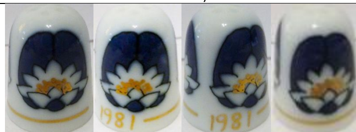
1981 lotus flower