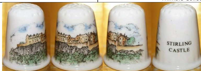
'Stirling Castle' with an earlier configuration of apex indents grey backstamp