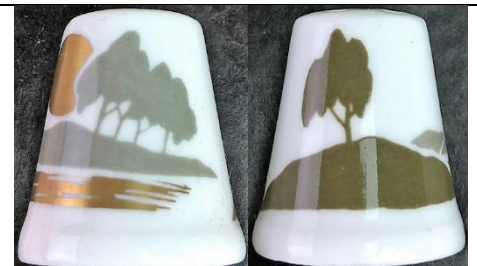
sun with Scottish landscape green with green first offered for sale by The Thimble Guild in March 1983