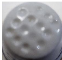
Highland China indentations in pattern of 14 indents with a flattish apex

Those that have later, regular indentations have a more domed apex than the original HC thimbles.