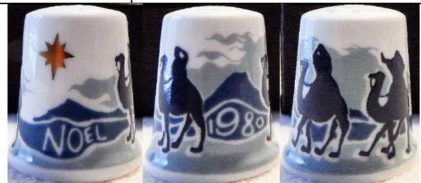
'Noel 1980' (Christmas) blues