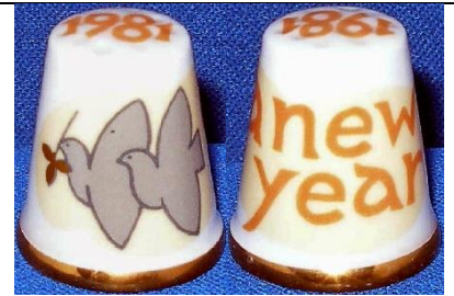
'New Year 1981' with doves