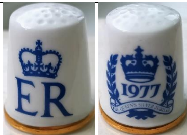
Queen Elizabeth 1977 Silver Jubilee no backstamp with an earlier configuration of apex indents

I have seen this thimble offered for sale as handpainted - it is not