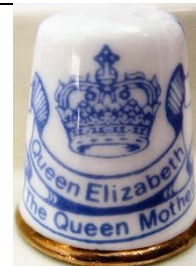
'Queen Elizabeth the Queen Mother' 80 th birthday 1980