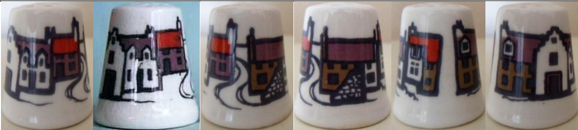
East Neuk houses

I have seen this thimble offered for sale as handpainted - it is not