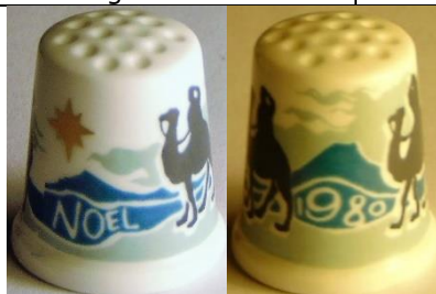
'Noel 1980' (Christmas) blues & greens