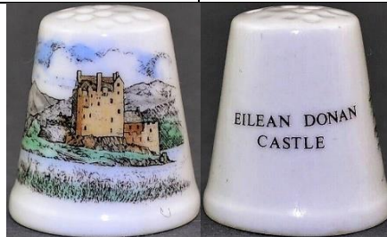
'Eilean Donan Perth'