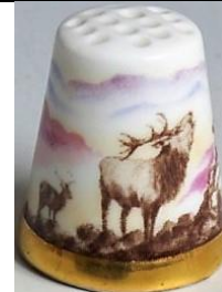
Stag Thimble Collectors Club