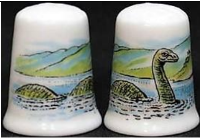
Loch Ness Monster with an earlier configuration of apex indents grey backstamp