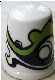
Celtic - green