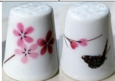
flowers - pink with butterfly