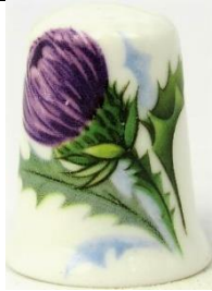
thistle with an earlier configuration of apex indents grey backstamp