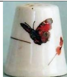
flowers - red with butterfly