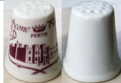
'Scone Palace Perth'