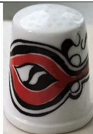
Celtic - red