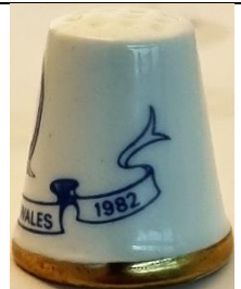
'H.R.H Diana Princess of Wales 21st' birthday July 1st 1982