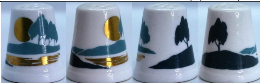
sun with Scottish landscape blue with black