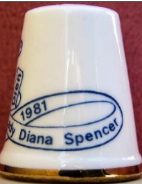
'H.R.H Prince of Wales and Lady Diana Spencer' wedding Ich Dien 29th July 1981