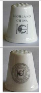
Hallmarked Thimbles of the World's Porcelain Houses (set of 50) showing variations in design and shape