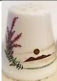
heather and sun landscape