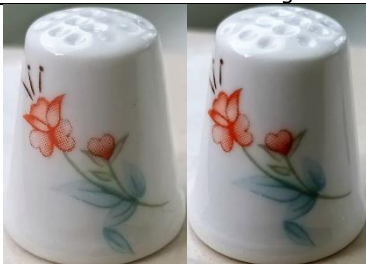
flowers - orange same decal on both sides