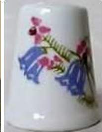
heather and bluebells