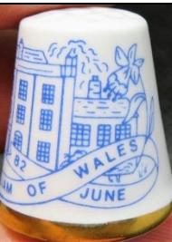
H.R.H Prince William of Wales 21st June 1982 with daffodils at each side