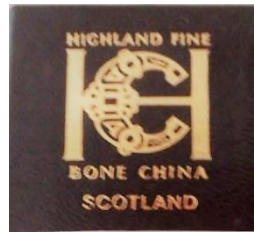
Highland China thimble box

The thimble boxes are a deep brown with the same original backstamp in gold.