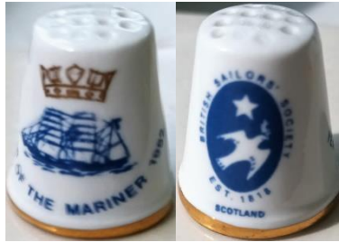
'Year of the Mariner 1982' British Sailors Society est. 1818 Scotland