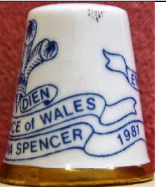
'H.R.H Prince of Wales and Lady Diana Spencer engagement' Ich Dien February 24 1981