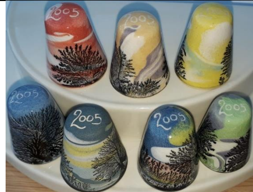
2005 - ii seven of the colours used – all so different flash used