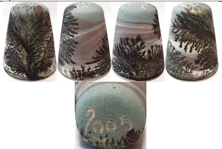
2005 – iiiii mauves thru pink