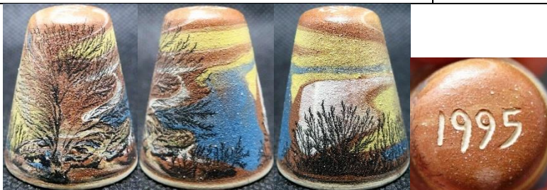
1995 - iiiii terracotta blue yellow roughish finish