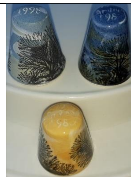
1998 - i three colours two are marked '19 Irving 98' flash used