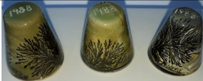
1988 darker colours gloss finish – bigger size