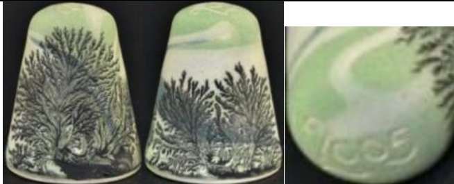
2005 – i pale green date doesn't show thru white clay