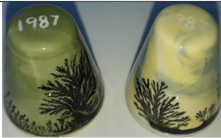
1987 - i olive greens pale yellows gloss finish – bigger size