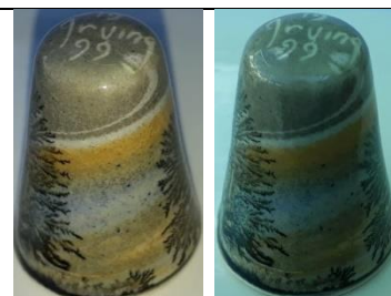
1999 - iiiii swirled muted multi-colours date marked with '19 Irving 99' (same thimble - with and without flash the colours are somewhere in between)