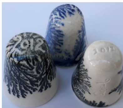
The fern pattern unusually creeps over the apex – the centre thimble has blue ferns.

The ferns are usually black but there are always exceptions. And no two are alike, both within a year date of from year to year.