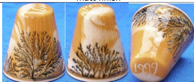
1999 - iii mocha pale pink gloss finish