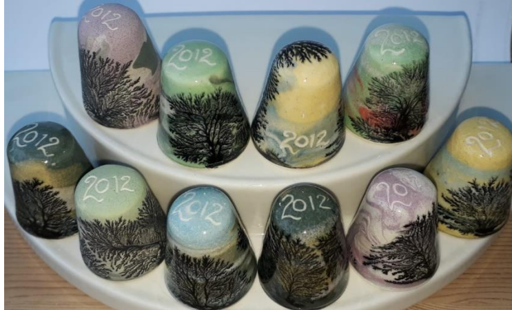
2012 - iii

variety of colours with a mouse – dates placed in different spots