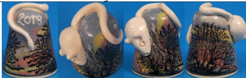
2018 – v greys salmon mocha mouse affixed around date lettered at apex gloss finish