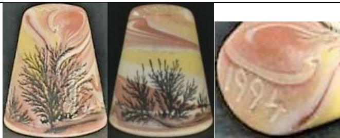
1994 - iii pale pinks pale ochre gloss finish