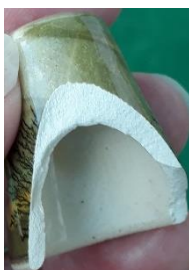
broken later thimble showing the beautiful white Cornish clay

On at least one occasion, Irving used his initial alongside the date – and on others 'Irving' is inscribed across the apex or alongside the rim of the apex. Yet at other times the name Irving is stamped into the clay.