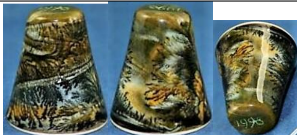
1998 - ii golds black pale blue gloss finish