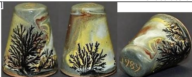
1989 - iii pale greens yellow