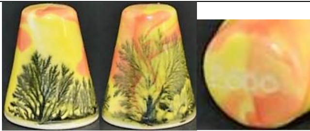
2000 – ii yellows apricot