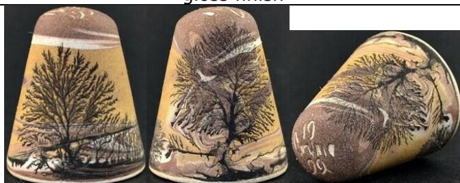
1999 - i pale pinks pale yellow date inscribed on apex as '19 Irving 99' matt finish