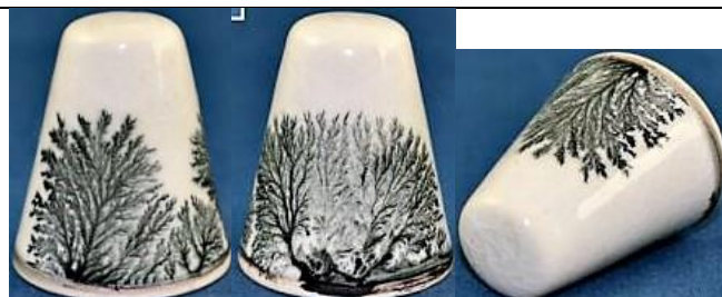
1999 - ii palest pink date is very pale