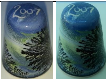
2007 - i swirled colours of blues and pale yellow (same thimble – with and without flash the colours are somewhere in between)