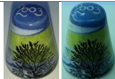
2003 deep blue with band of yellows (same thimble – with and without flash the colours are somewhere in between)