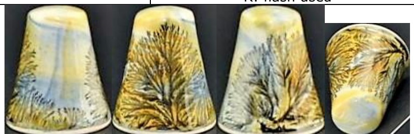
1997 - iii yellows pale blues date doesn't show thru white clay