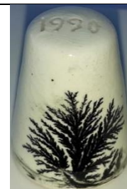
1990 creams – which highlights the ferns