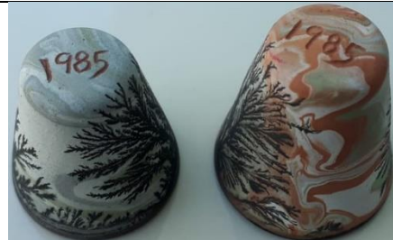
1985 blues green - terracotta matt finish - small size