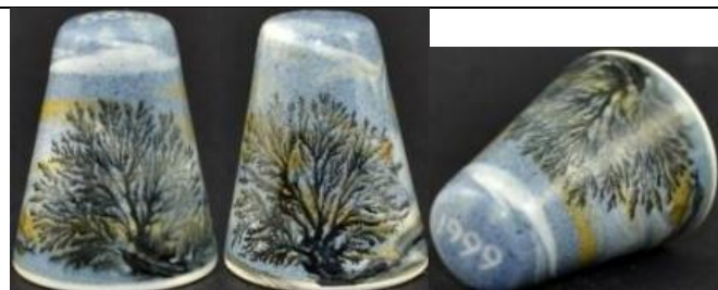
1999 - v blues gloss finish