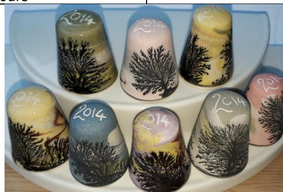
2014 - iii eight of the colours on his traditional thimbles with no embellishments