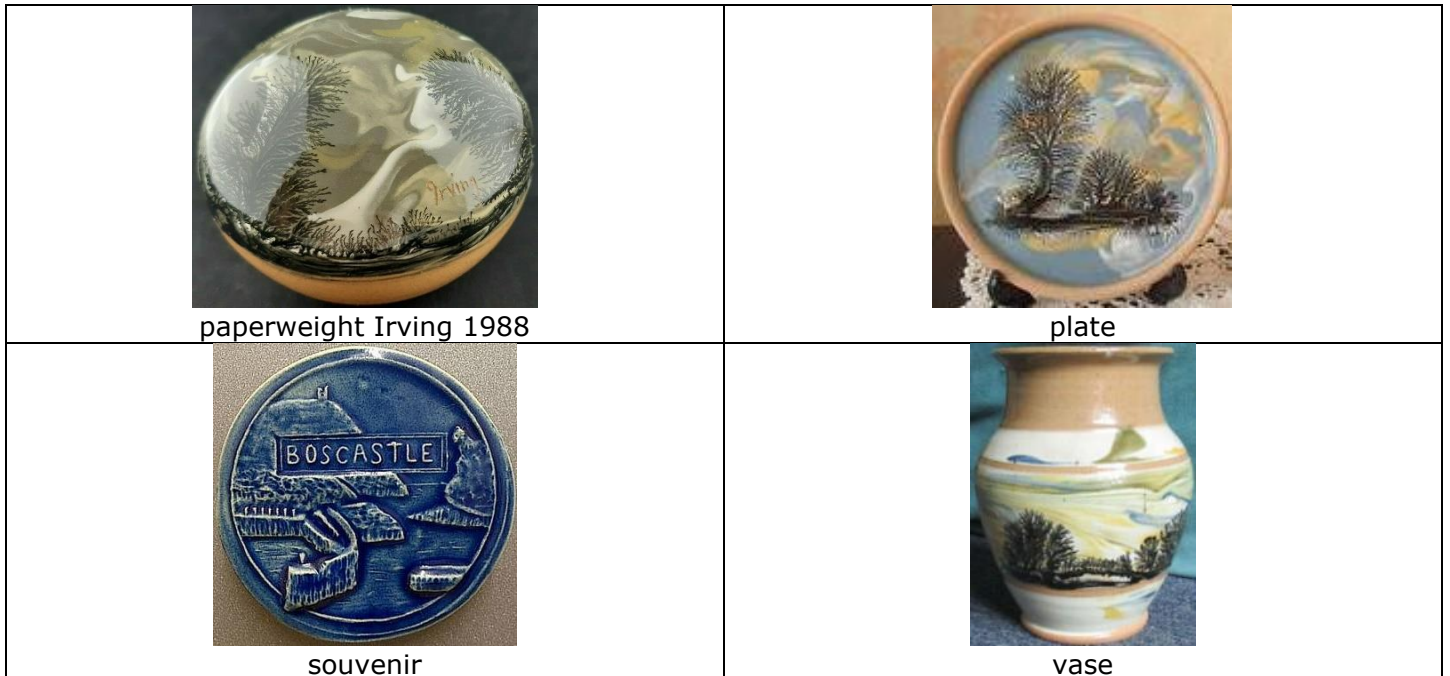
paperweight Irving 1988

Their primary production is making household wares in all the hues created by Irving and Tim Little.