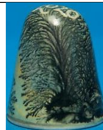
2020 – iiii sand green fern dominates this side of thimble