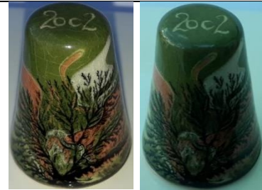
2002 – ii his favourite colours of greens and pinks (same thimble – with and without flash the colours are somewhere in between)