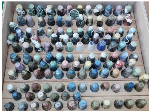
a collection of about 120 Boscastle thimbles

I have noticed that as some of the thimbles age, the thimbles have begun to craze (fine lines). This is evident on thimbles for sale on ebay