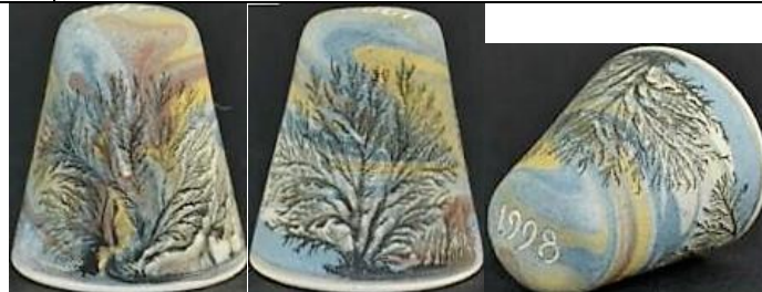
1998 - iii pale blues pale ochres