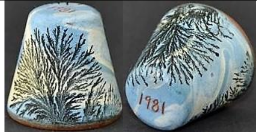
1981 blues date lettered on apex small size