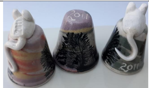
2011 - i a mouse added on the apex allowed Irving to experiment with the date placement L: 2011 date is stamped into the mouse on the apex – centre: standard R: the date appears at rim