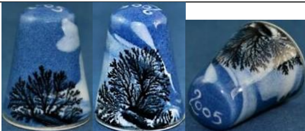
2005 – iii strong blue to pale blues