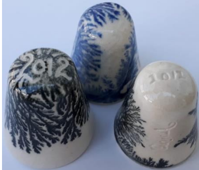
2012 - i

variety of base colours all traditionally marked on the apex plus with the new mouse design just showing the date apex view