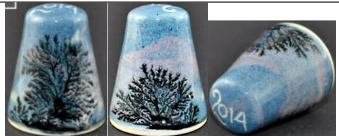
2014 - ii blues pink gloss finish