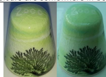
2000 - i soft greens (same thimble - with and without flash the colour is somewhere in between)