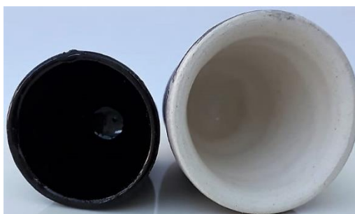
the small sized early matt thimbles had a brown inner glaze (1980-1984) – after that, the glaze is white

The apex on most of the thimbles is smooth i.e., no indentations. Exceptions seem to occur regularly – see 2013 and 2020.