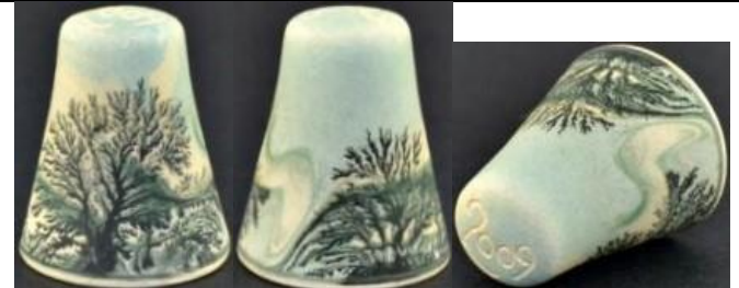
2009 pale blue