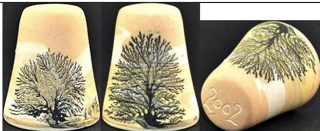
2002 – iii pale apricot yellow