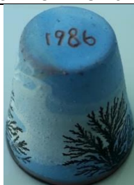
1986 - i blues matt finish - small size