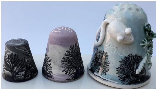
three sizes of Boscastle thimbles – L: small (1980-1986) – current size – R: exhibition size

Initially the Boscastle thimble sizes were quite small, measuring about one inch (254mm) in height. The current size is larger at 1.25 inches (317mm) and there is an exhibition size, which measures two inches (508mm) high and two inches (508mm) wide!!