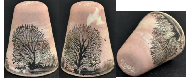
2002 - i pink