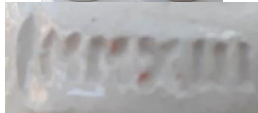
2013 - iiiii cream lettered in Roman numerals stamped near the apex on mice thimble 'Irving' stamp near apex rim indentations on apex exhibition size