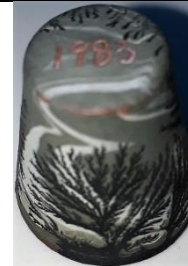
1983 - i grey - dark blue matt finish - small size