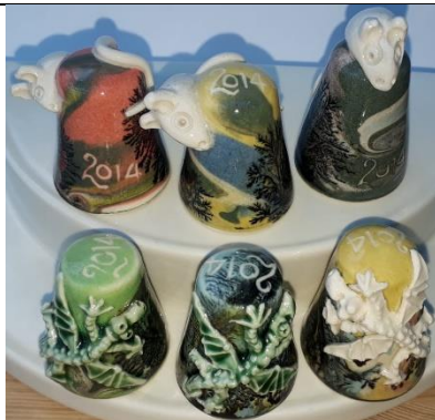
2014 - i Irving added dragons to his mouse series for these six thimble colours