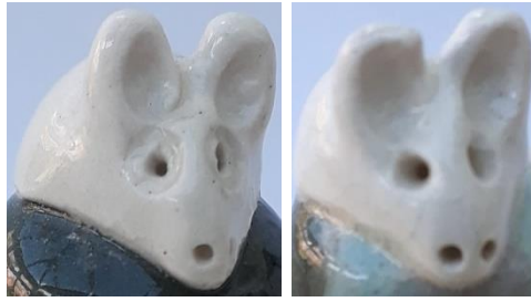
being handmade even the mice have different features

In 2011, the Littles added little creatures to the surface of their thimbles. Initially these were a mouse or mice , where their long tails trail around the thimbles. The mice were all made by hand. Even these vary in their detail. The annual thimbles from 2013 were available in both mouse and traditional thimbles.