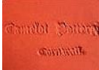
Camelot mark found on Boscastle Pottery homewares