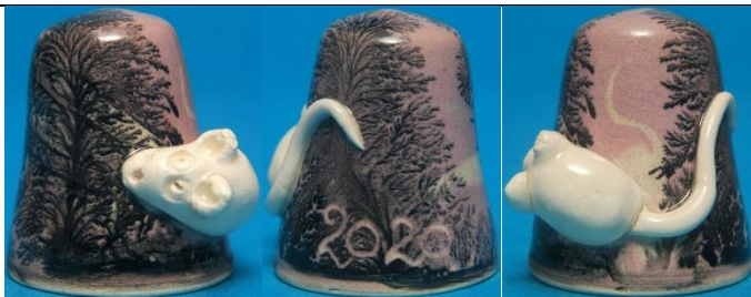
2020 – iii pinks mouse affixed around date lettered around rim gloss finish