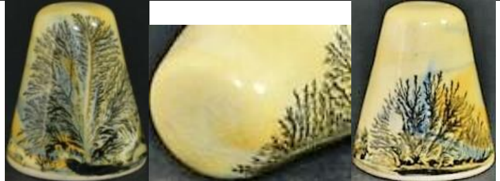
1995 - iii yellows date palely lettered on apex gloss finish