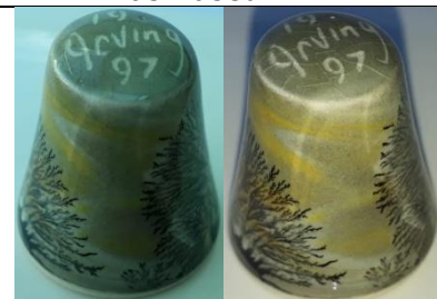
1997 - i olive greens date inscribed on apex as '19 Irving 97' R: flash used