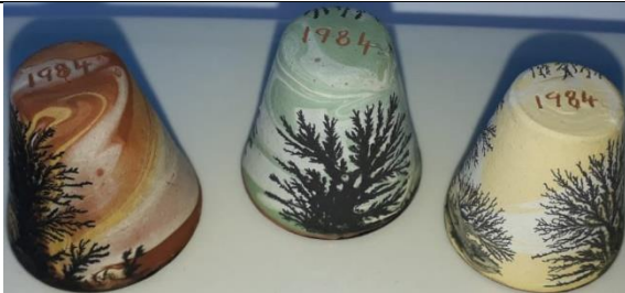
1984 three of the many different colours on offer matt finish - small size