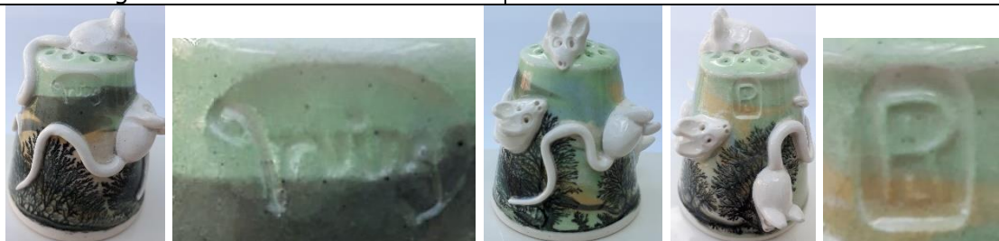
undated unusual mix of colours – Irving mark - mark with tiny I and L inside R (for Irving's initials) at apex rim flat apex with distinctive indentations exhibition size with three mice affixed