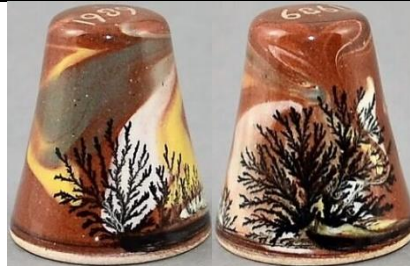
1989 - ii chocolate browns and yellow