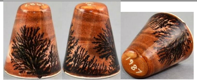
1987 - ii dark terracotta gloss finish – bigger size