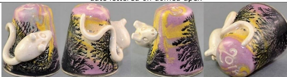
2018 – vii deep pink ochres mouse affixed around