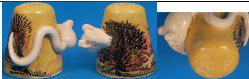
2018 – iii mocha salmon mouse affixed gloss finish