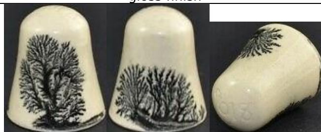
2018 – vi beige date lettered on domed apex