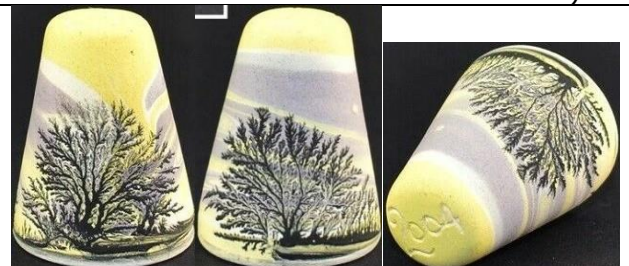
2004 – ii lemon yellow grey