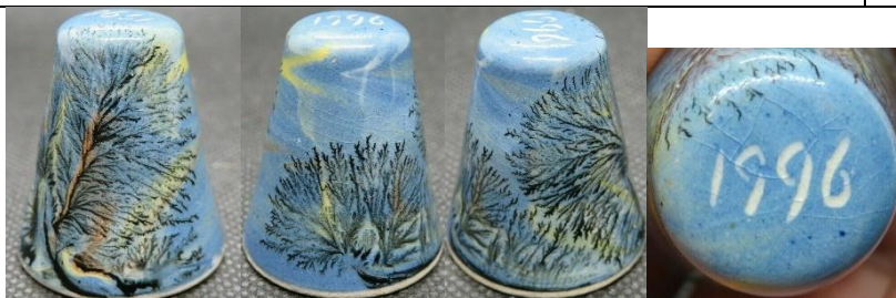
1996 - ii blues yellow gloss finish