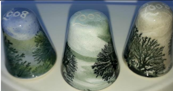
2008 three palish shades from this year flash used