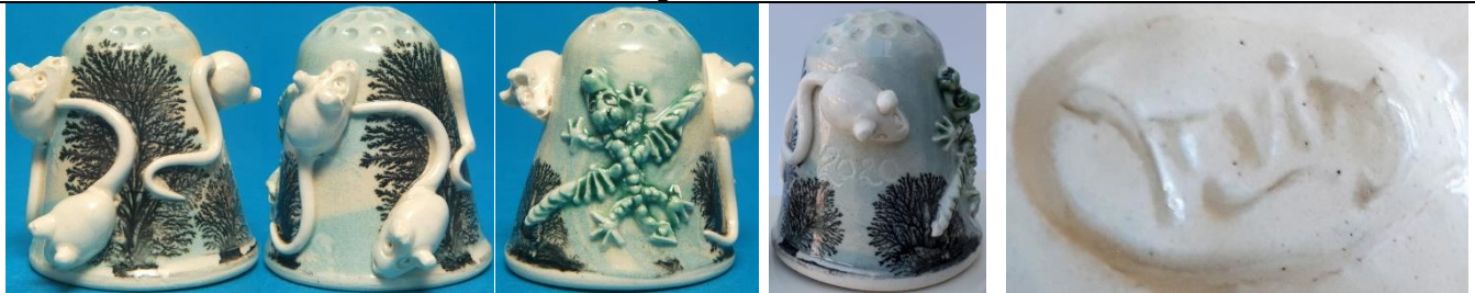
2020 – ii pale blue pink indents on domed apex greenish dragon affixed around with three mice with more than one critter this is his exhibition sized thimble centre: date on side below mouse R: Irving signature