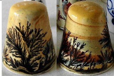
1987 - iii ochres greens