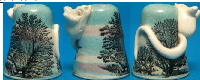
2020 – i blues pink lettered on top pink mouse affixed around gloss finish