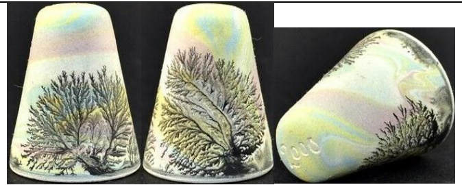
2000 – iii pale rainbow shades