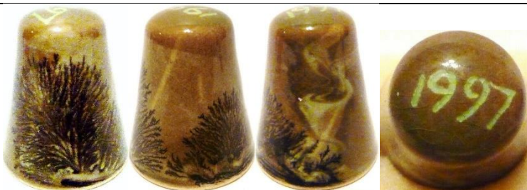
1997 - iii caramel cream