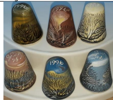
1996 - i different coloured ferns on darker bases flash used