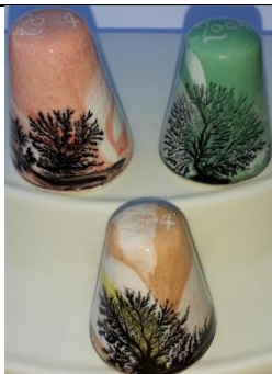
2004 - i three of the colours produced during the year flash used