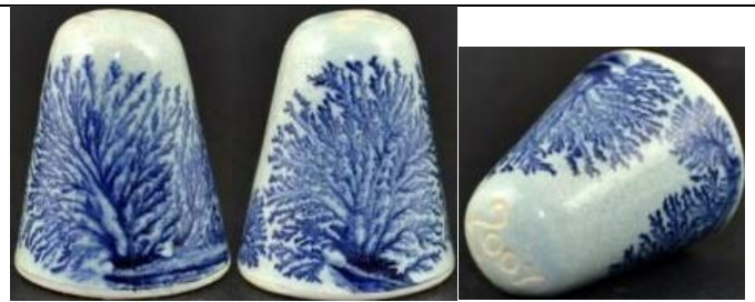
2007 - ii blue ferns on white and pale blue it's rare to find the ferns in this colour