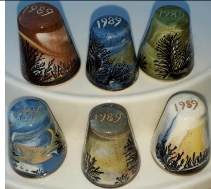
1989 - i six of the colour range available gloss finish – bigger size