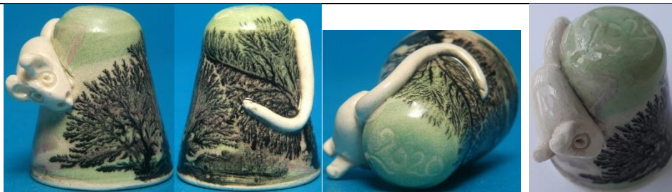
2020 – ii pale green lettered on top mouse affixed around gloss finish