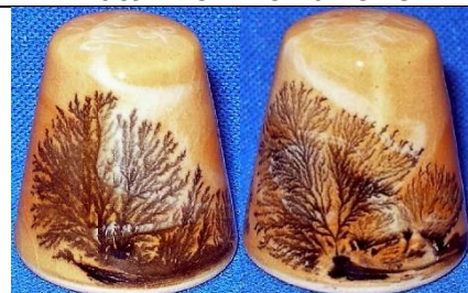
1986 - ii mocha gloss finish - bigger size