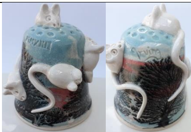
2013 - iii blended colours with blue apex lettered in Roman numerals stamped near the apex on mice thimble different 'Irving' stamp near apex rim indentations on apex exhibition size