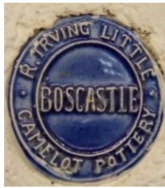
a blue Boscastle Pottery plaque on the pottery wall