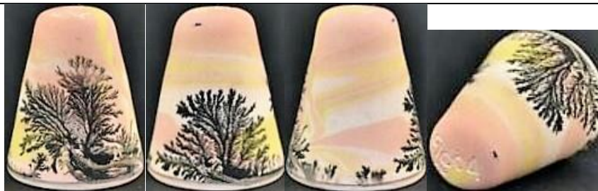
2004 – iii pale pink pale ochres