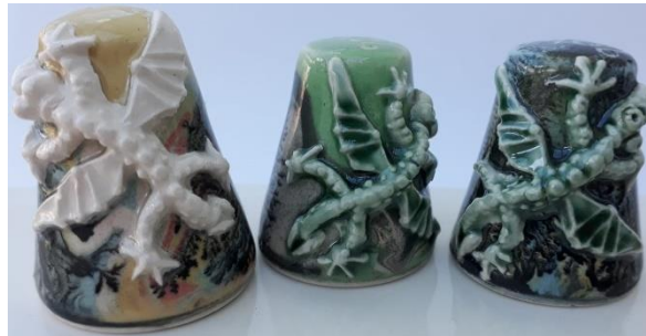
2014 dragons have the same wingspan

This is a symbol to indicate there was a takeover of a local pottery by Boscastle in 2014.