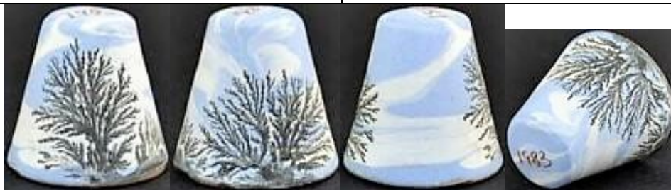
1983 - ii blues matt finish - small size