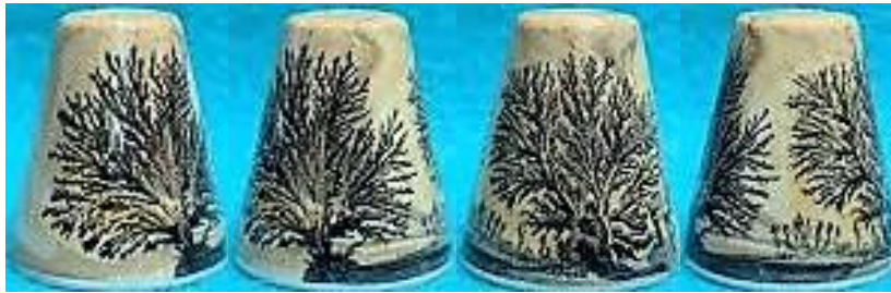
ferns in black that identify Boscastle Pottery thimbles

Boscastle Pottery specialises in a technique known as Mocha ware . This is achieved by using a "Mocha tea", which is applied to the clay slip. The tea runs thru the slip creating a fern-like (or tree) pattern. The tea contains a staining agent. Traditionally this was tobacco but nowadays coffee is used, or various chemical recipes are used.