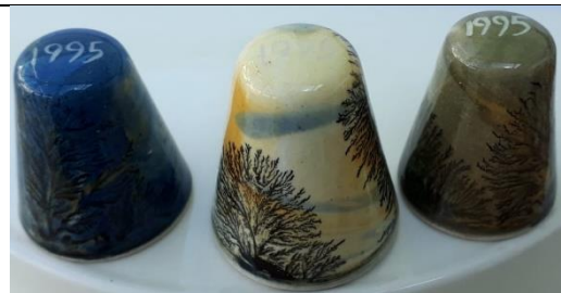
1995 - i deep blue/ochre yellows/brooding greens gloss finish – no use of flash