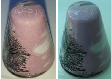
2001 – i pink (same thimble – with and without flash the colour is somewhere in between)