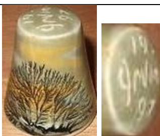
1997 - ii mocha pale apex date inscribed on apex as '19 Irving 97'