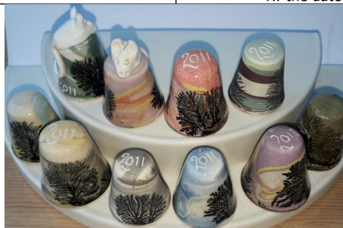
2011 - ii a selection of ten of Irving's 2011 shades – the two mouse additions will have the date placed off the apex (as shown above) flash used