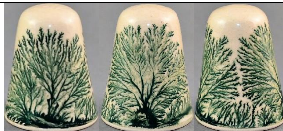
2012 - iiiii

these ten colour varieties have the date on the apex – I love the flash of red on the upper R flash used