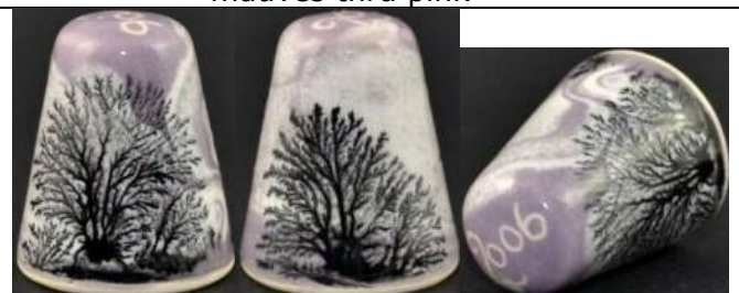
2006 - ii swirled colours of mauve