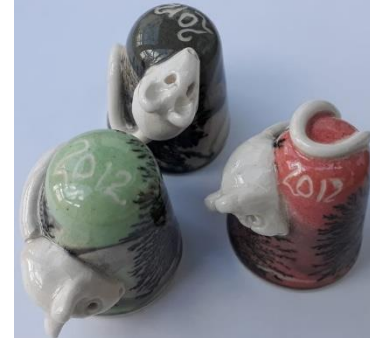
2012 - ii

experimenting with different colours of fern L: creeping onto apex C: blue R: standard