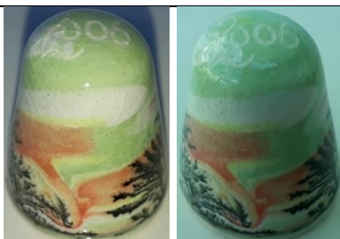
2006 - i swirled colours of greens and orange (same thimble – with and without flash the colours are somewhere in between)