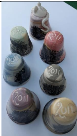
2011 - iii

variety of base colours all traditionally marked on the apex plus with the new mouse design just showing the date apex view