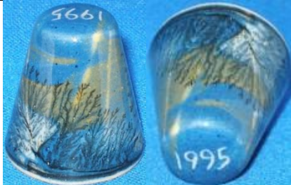
1995 - ii blues gloss finish