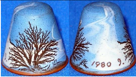
1980 blues date lettered at rim with cursive 'I' small size