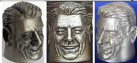
President Ronald Reagan on occasion of his inauguration 1989 (sold thru The Thimble Guild)