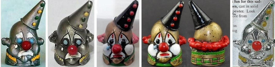
R: I have seen this clown advertised as made by Sheffield Pewter in August 2004 by The Thimble Guild – it still bears the TP mark – on right hand edge