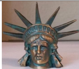
Lady Liberty bronzed