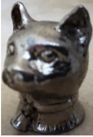
cat with bell