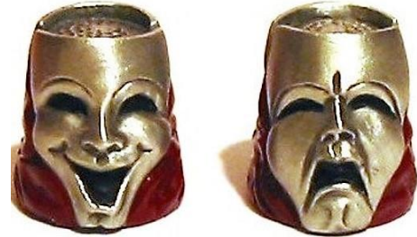
masks happy - sad