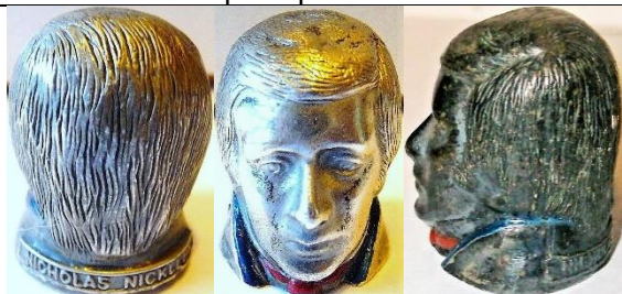
Nicholas Nickleby part-painted