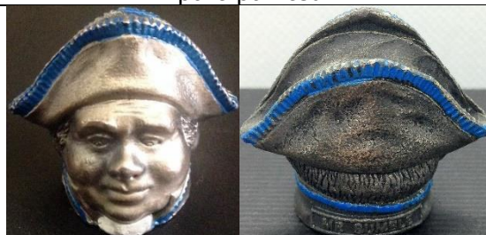
Mr Bumble part-painted