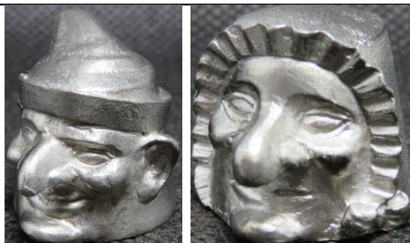
Punch and Judy