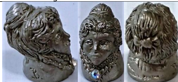
woman with a 'diamond' crystal necklace signed 'B'