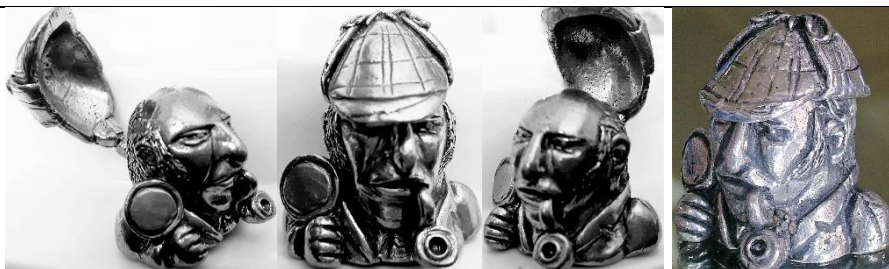
Sherlock Holmes hinged hat (borderline inclusion)