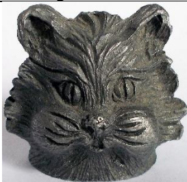
cat - fluffy 1988