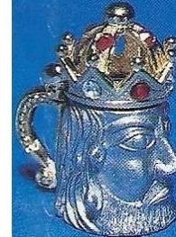
crowned king Is this thimble the same as at L? This gold-plated crown with faux jewels lifts off to reveal the thimble alongside?