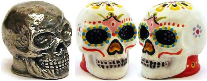
Skull - Day of the dead