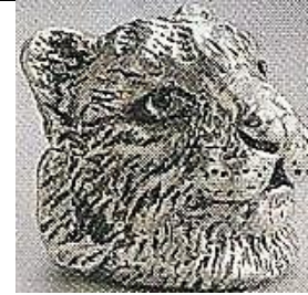
tiger with sparkly eyes USA