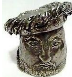
King Henry VIII no maker's mark