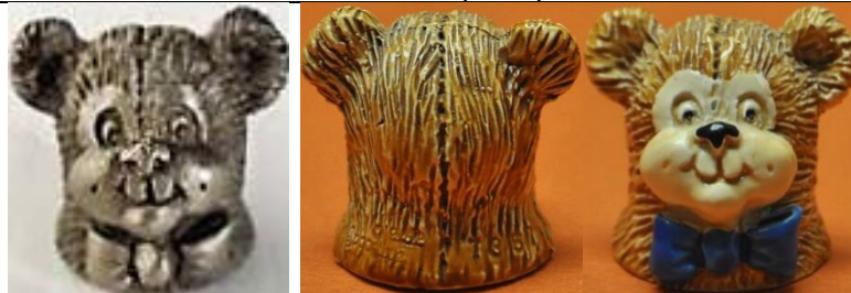
1982 - '7357' R: fully-painted

+ unknown six-digit number R: bronzed and part-painted