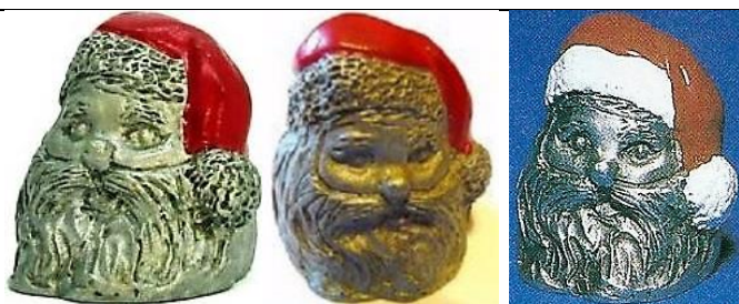
Santa 1980 part-painted is thimble at R marked with a different date? possibly 1987?