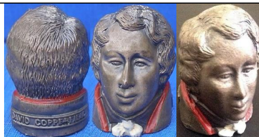
David Copperfield part-painted