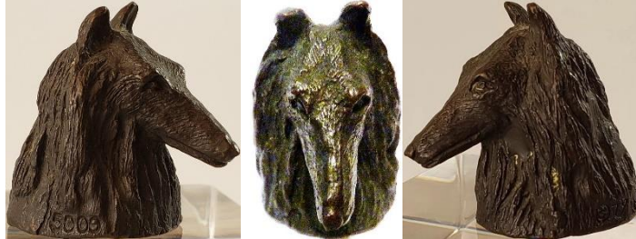
collie 1979 numbered edition out of 5000