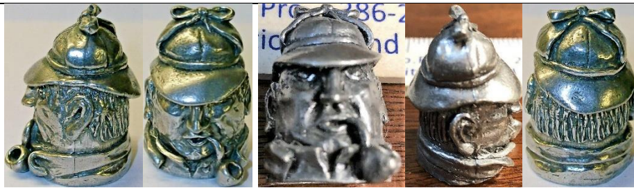
Sherlock Holmes - ii