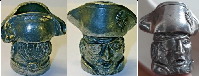
Nelson sporting his famous eye patch no maker's mark