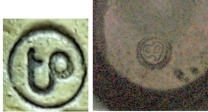
R: mark on Reagan thimbles

The painters have had fun with their paintbrushes creating 'different' clowns, partly-painted from the same mould, even emphasising their eyes.