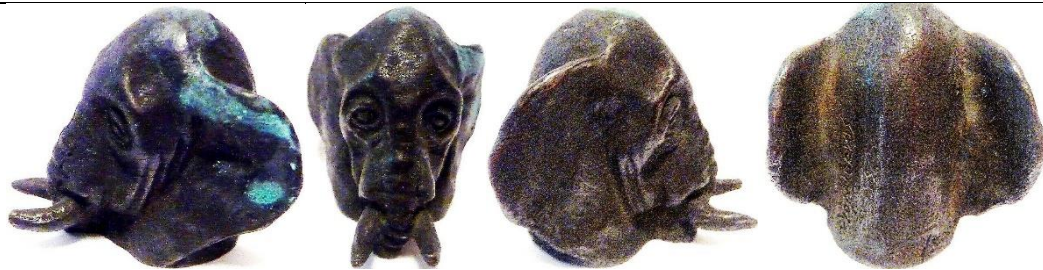
elephant 1979 numbered edition out of 5000