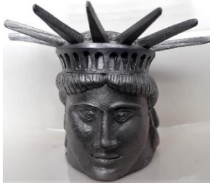
Lady Liberty indentations on her head