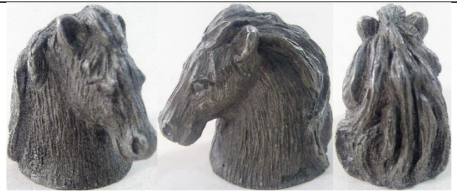
horse 1981 'Spo'