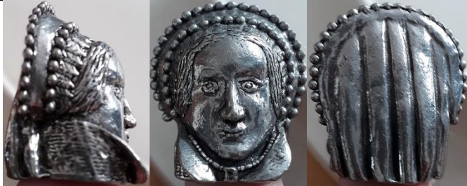
Anne Boleyn no maker's mark