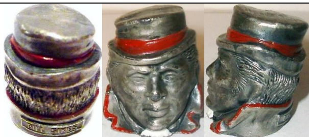
Bill "Sikes" part-painted