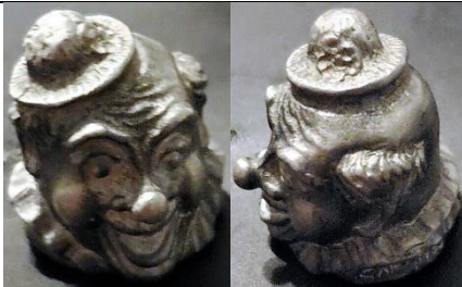
clown - 1983