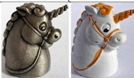
unicorn 1984 R: fully-painted