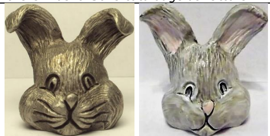
Rabbit R: fully-painted