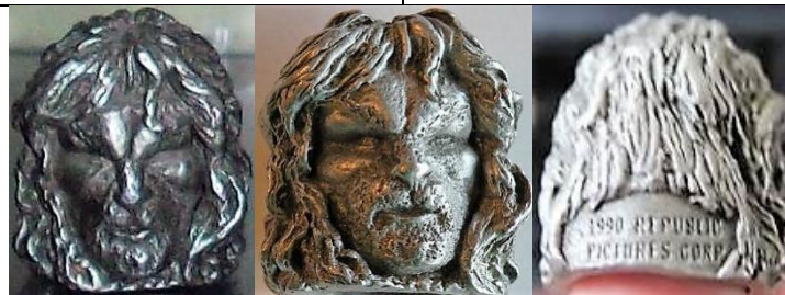
Vincent - Beauty and the Beast