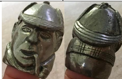
Sherlock Holmes - i