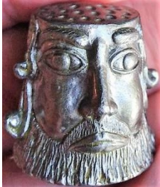
bearded man thimble has indentations in the flat apex